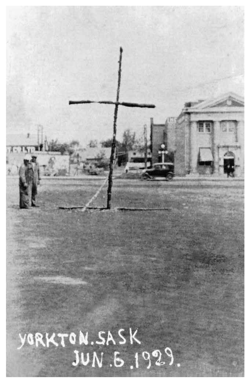
Cross erected by the Ku Klux Klan in Yorkton, Saskatchewan, on election-day, 6 June 1929. It was burned to celebrate the victory of the Conservative Party over the Liberals.