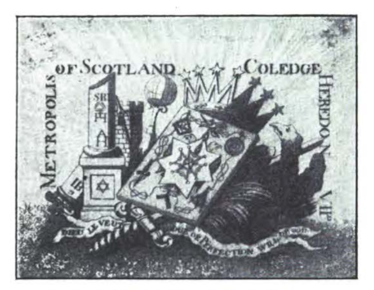
PLATE OF LODGE OF PERFECTION OF SCOTLAND