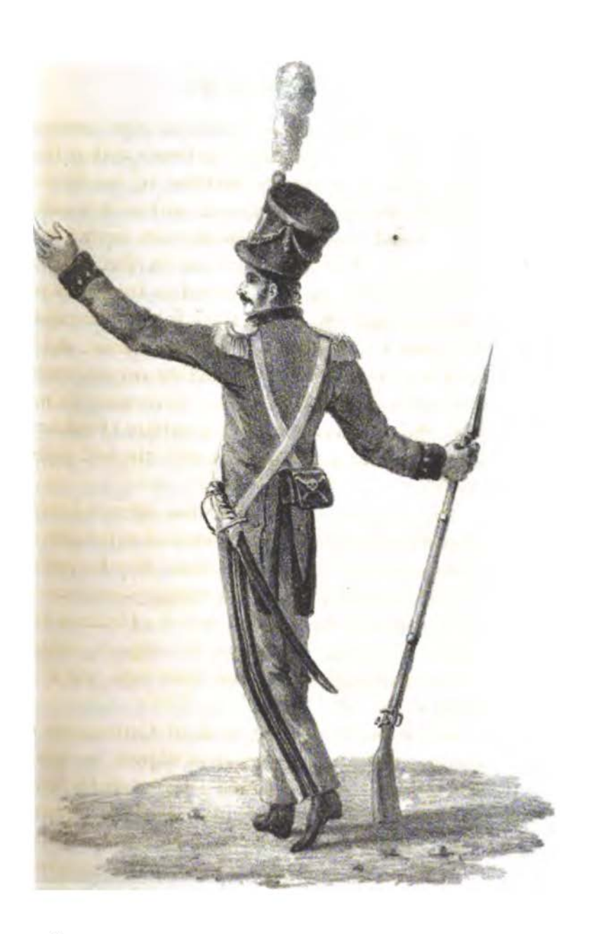
SWARD OF THE CARBONARA LEGIOU.

London Published by Murray Albertaries III 10/32/.