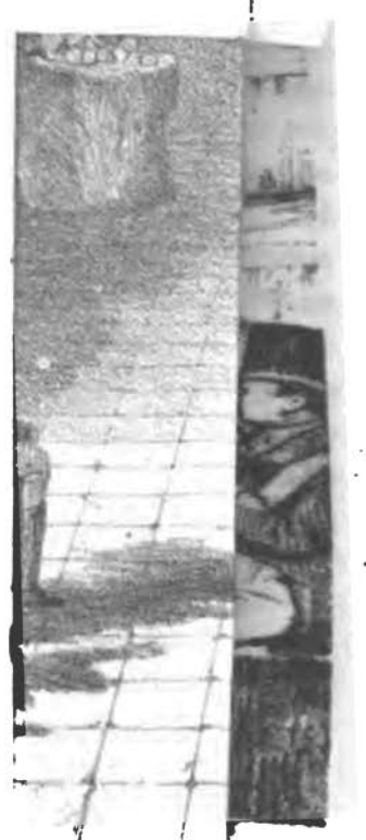
iter. 4. Orator.