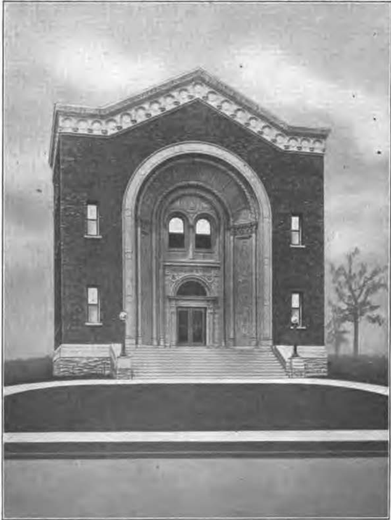
Temple of Hanselmann Lodge, Cincinnati, Ohio.