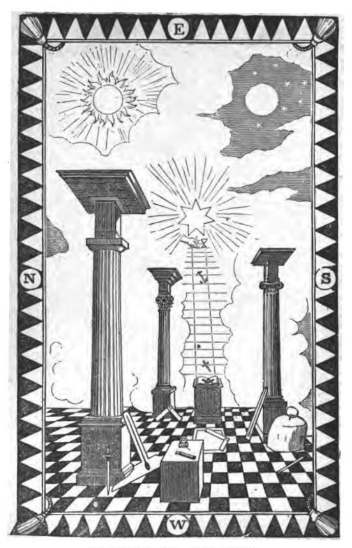
THE ENTERED APPRENTICE.