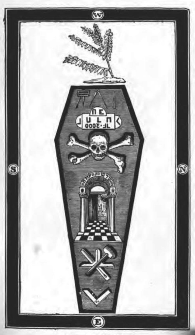
THE MASTER MASON.