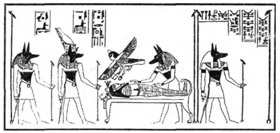
Anubis, the Egyptian jackal-headed "god of the dead" was called the "guardian of the secret of transformation" and leads the deceased "toward a state of bliss or to greivous trials". According to myth, Anubis was the son of Nephthys, by her brother Osiris. Nephthys was raised by Isis and helped find and embalm the body of Osiris after his murder.

The first Lodge of the Philadelphians in England was established at the end of 1850. Its constitution was ratified by the Supreme Council of the Order (Conseil Supreme de 1'Ordre Maconnique de Memphis) on January 31, 1851.<sup>7</sup> It became the centre of the Philadelphians' activity among the French emigres, though in general anybody who spoke French was admitted. The Lodge's work was successful. In