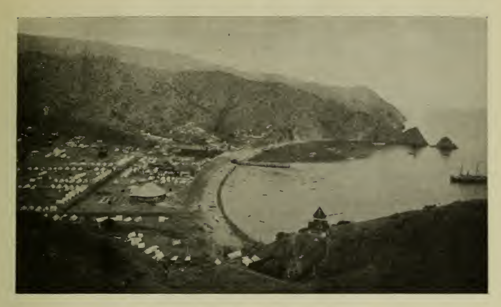
AVALON, SANTA CATALINA ISLAND, CALIFORNIA.