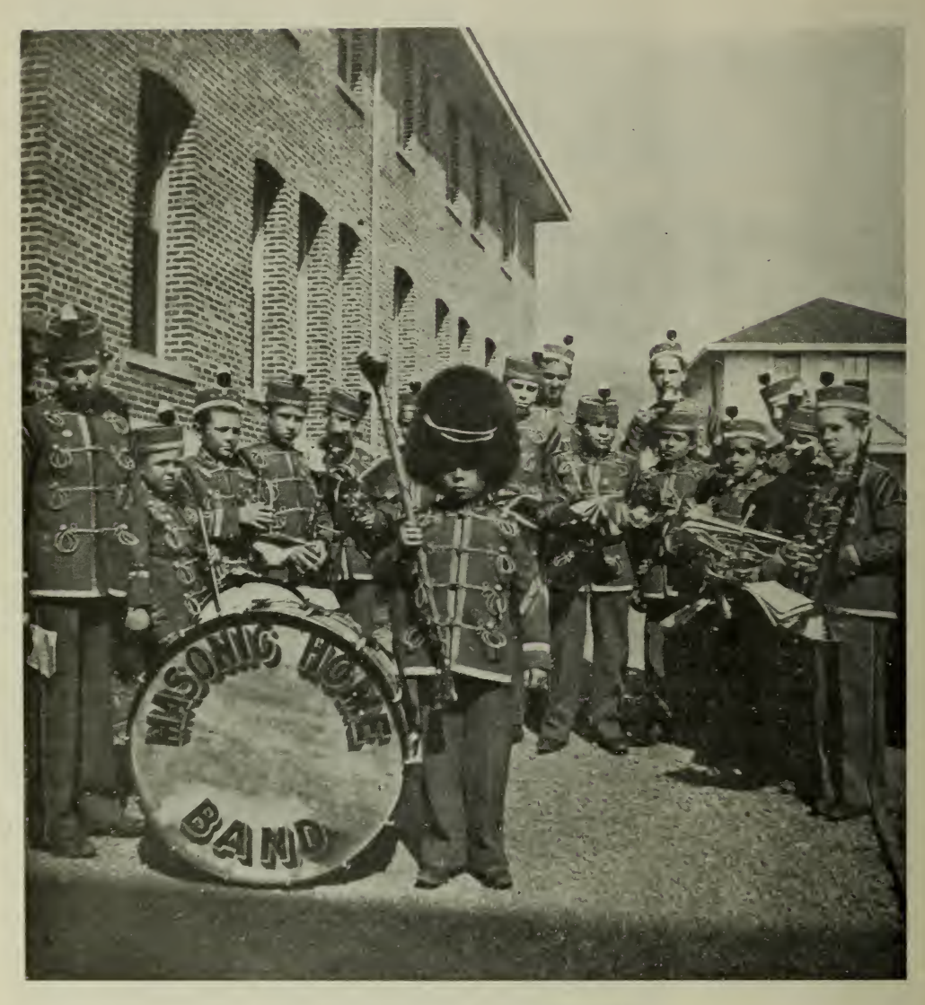
BOYS' BAND, CALIFORNIA MASONIC HOME