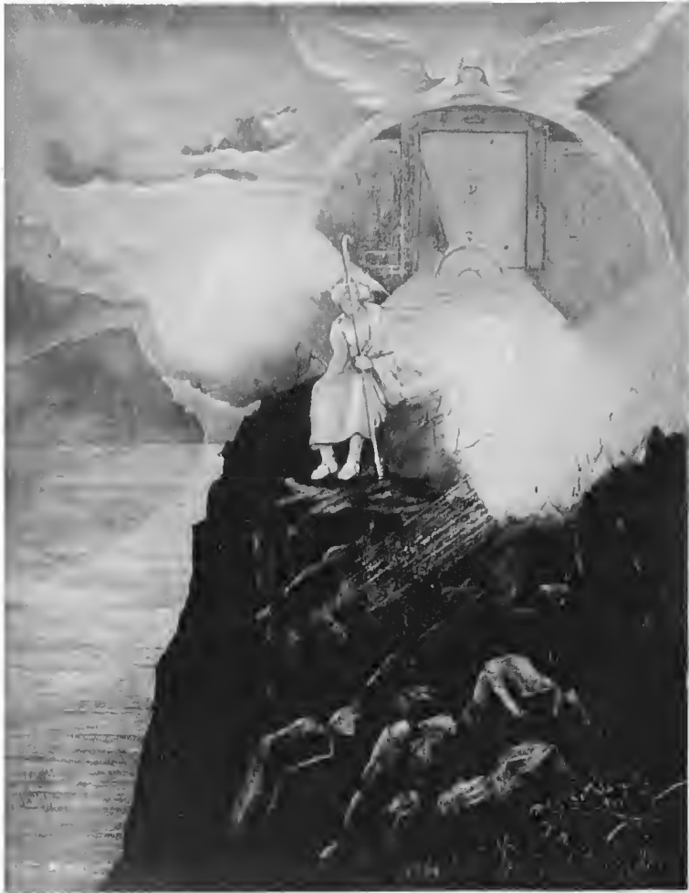
Drawn by I. de Steiger.

—days and nights dissolve By this low-breathing sea, While here I pause and still revolve Voyage and venture free!