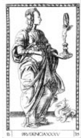
PRUDENCE MANTEGNA DECK

We also find female Chariot cards in three or four deeply Gnostic-influenced Tarots, suggesting that this is the ancient “Triumphant Chariot of Venus,” an old mythological and alchemical theme highlighted by the fourteenth century poet Petrarch in his poem I Triumphi . The power of Venus lies in harmony, magnetism and the art of raising consciousness through the power of attraction and pleasure. Left alone, Nature rewards right action with joy and fulfillment, implying a trust in instinct and intuition which the Judeo-Christian tradition has rejected.