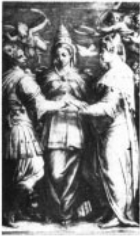
“PAPAL TRIUMPH” BY GIORGIO VASSARI MID 1500’S