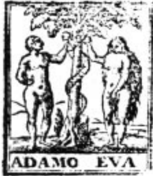
ADAM AND EVE LABYRINTH GAME

principle. Gnostics fostered the belief that Sophia, the Wisdom element of God, was feminine and represented the mind, meaning the actual conscious thinking that was vested in the making of Creation by the Creator. It is she who takes the creative juices of God and ferments them into the tangible world, the ecology of life. She creates what is actual out of the infinity of creative possibilities inherent in God, the undifferentiated Power.