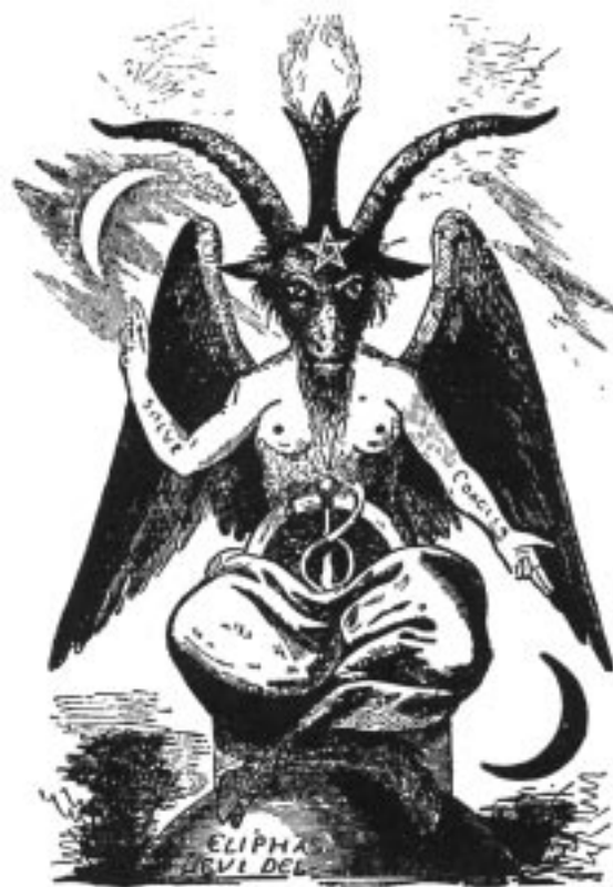
From Levi's Transcendental Magic . BAPHOMET. THE GOAT OF MENDES.

The Tarots that are more optimistically Gnostic emphasize the sensuous breasts and wasp waist, sometimes giving her angel wings rather than bat wings, and referencing her body parts to the elements of Nature (fire in the head, air in the breast, water in the bowels, and earth in the legs). Any Tarot that places a caduceus upon the belly of an obviously female Devil card, whether the caduceus is