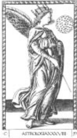
ASTROLOGIA MANTEGNA DECK

Reincarnation was part of the belief system of the ancient world. In a very general sense, the Gnostic gospels assert that when the Creator fashioned the material plane, it was set up in solar system form with seven planets. At that time people thought the planets all revolved around Earth and that Earth was protected and guarded by the rings of the other planets.