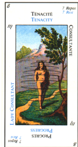
EVE GRIMAUD ETTEILLA DECK

Only in Gnostic thought do we find a positive interpretation of the snake in the garden. The card that substitutes for the