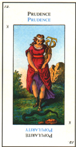
PRUDENCE GRIMAUD ETEILLA DECK

Hanged Man in the Eteilla deck has left behind the Judeo-Christian idea of human guilt for the “fall of man” and its expiation in