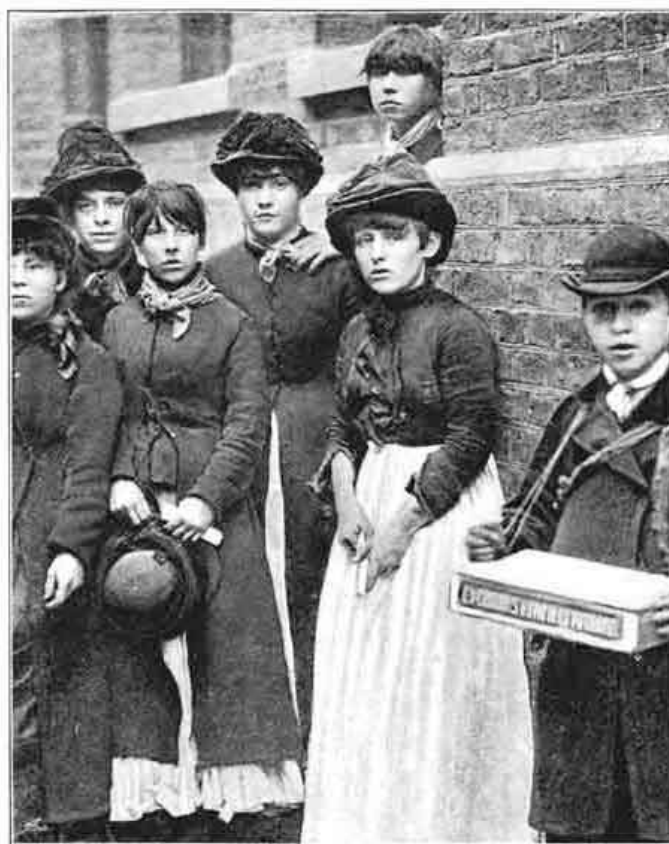
MEMBERS OF THE MATCHMAKERS' UNION.

of, H.P. Blavatsky. Ever more and more had been growing on me the feeling that something more than I had was needed for the cure of social ills. The Socialist position sufficed on the economic side, but where to gain the inspiration, the motive, which should lead to the realisation of the Brotherhood of Man? Our efforts to really organise bands of unselfish workers had failed. Much indeed had been done, but there was not a real movement of self-sacrificing devotion, in which men worked for Love's sake only, and asked but to give, not to take. Where was the material for the nobler Social Order, where the hewn stones for the building of the Temple of Man? A great despair would oppress me as I sought for such a movement and found it not.