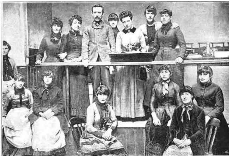
STRIKE COMMITTEE OF THE MATCHMAKERS' UNION.

In August I asked for a "match-girls' drawing-room." "It will want a piano, tables for papers, for games, for light literature; so that it may offer a bright, homelike refuge to these girls, who now have no real homes, no playground save the streets. It is not proposed to build an 'institution' with stern and rigid discipline and enforcement of prim behaviour, but to open a home, filled with the genial atmosphere of cordial comradeship, and self-respecting freedom—the atmosphere so familiar to all who have grown up in the blessed shelter of a happy home, so strange, alas! to too many of our East London girls." In the same month of August, two years later, H.P. Blavatsky opened such a home.