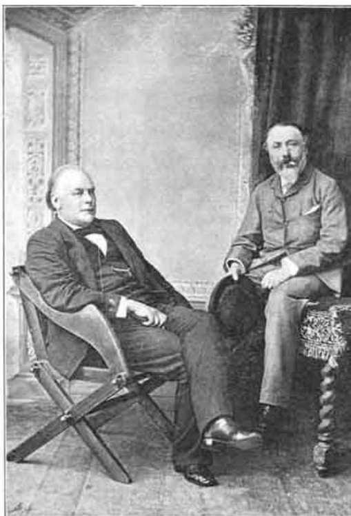
CHARLES BRADLAUGH AND HENRY LABOUCHERE