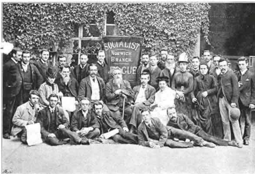
NORWICH BRANCH OF THE SOCIALIST LEAGUE

victor well-nigh bankrupt in health and in purse, and sent him to a comparatively early grave. He lived long enough to justify his election, to prove his value to the House and to his country, but he did not live long enough to render to England all the services which his long training, his wide knowledge, his courage, and his honesty so eminently fitted him to yield.