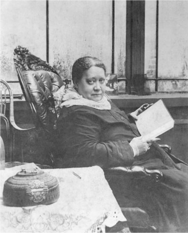
HPB at "Maycot," Upper Norwood, London, 1887

after the mortal disease which cleansed me if it did not carry me off. Love & sincere, as usual, & for ever. Yours in heaven & hell. "O.L." H.P.B.