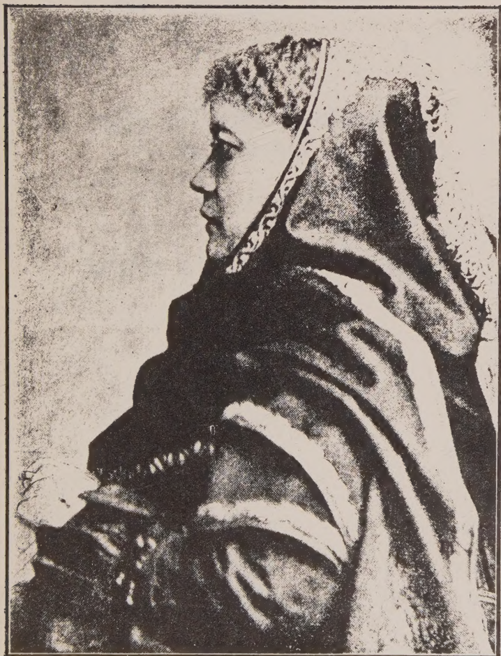
AN EARLY PROFILE OF H. P. B.