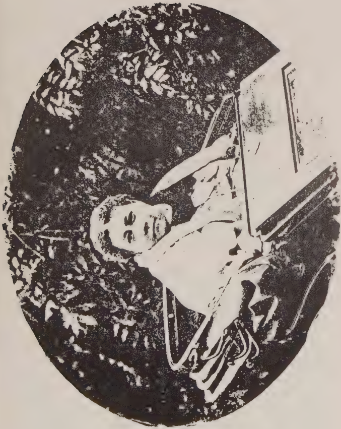
H. P. B. IN HER BATH-CHAIR AT AVENUE ROAD, 1893.