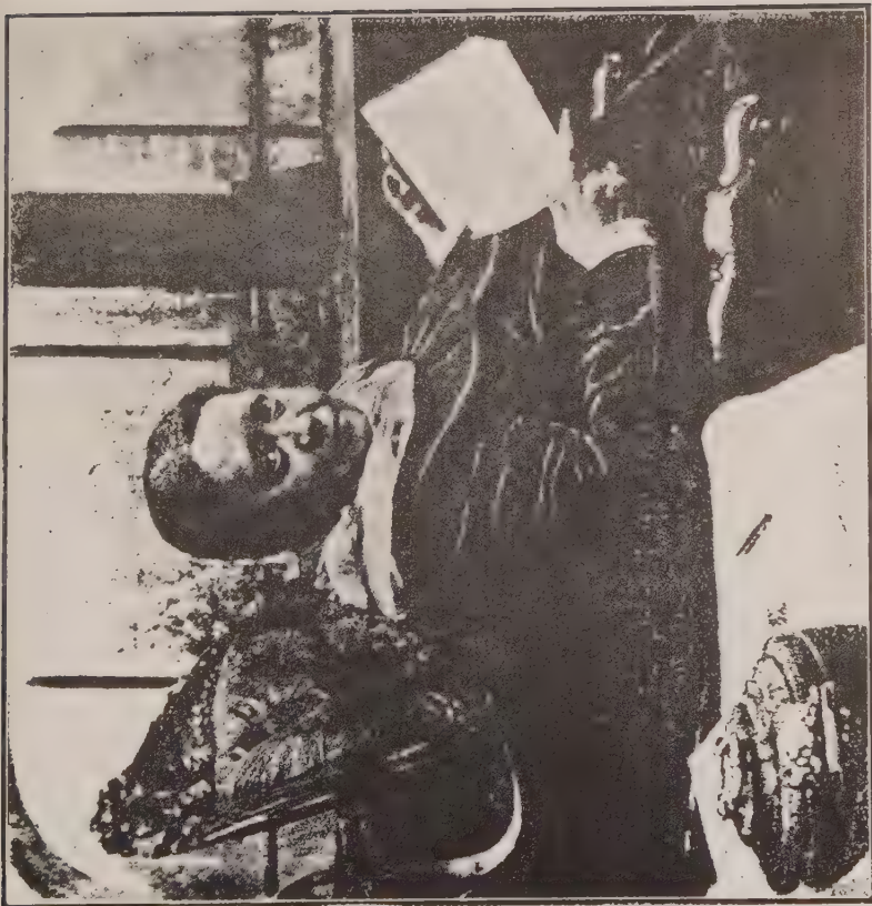
H. P. B. IN HER ARM-CHAIR AT "MAYCOT," 1887.