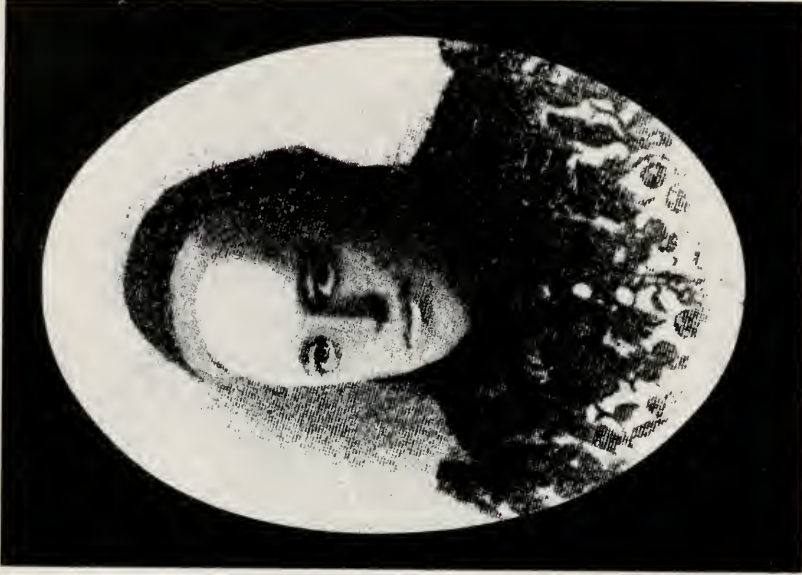
Londond Photo & Engraving Dept.