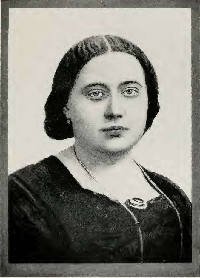
Lomalind Photo & Engraving Dept.