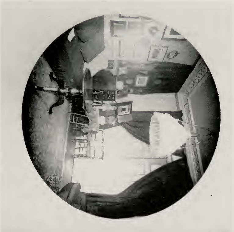
H. P. BLAVATSKY'S RECEPTION- AND WORK-ROOM AT 17 LANDSDOWNE ROAD Here she wrote The Voice of the Silence , The Key to Theosophy and other works.