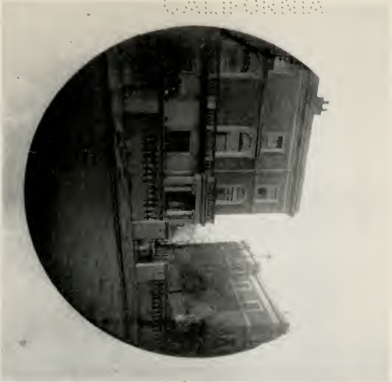
17 LANDSDOWNE ROAD, HOLLAND PARK, LONDON, W. Where H. P. Blavatsky lived before making 19 Avenue Road her final Headquarters.