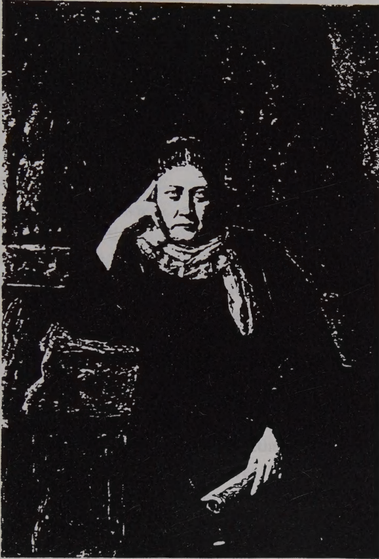
Portrait of a woman, possibly a historical figure.

knowledge, which, though but just dawning on our generation, is manifestly, for all who can appreciate it, the most sublime to which human intelli-