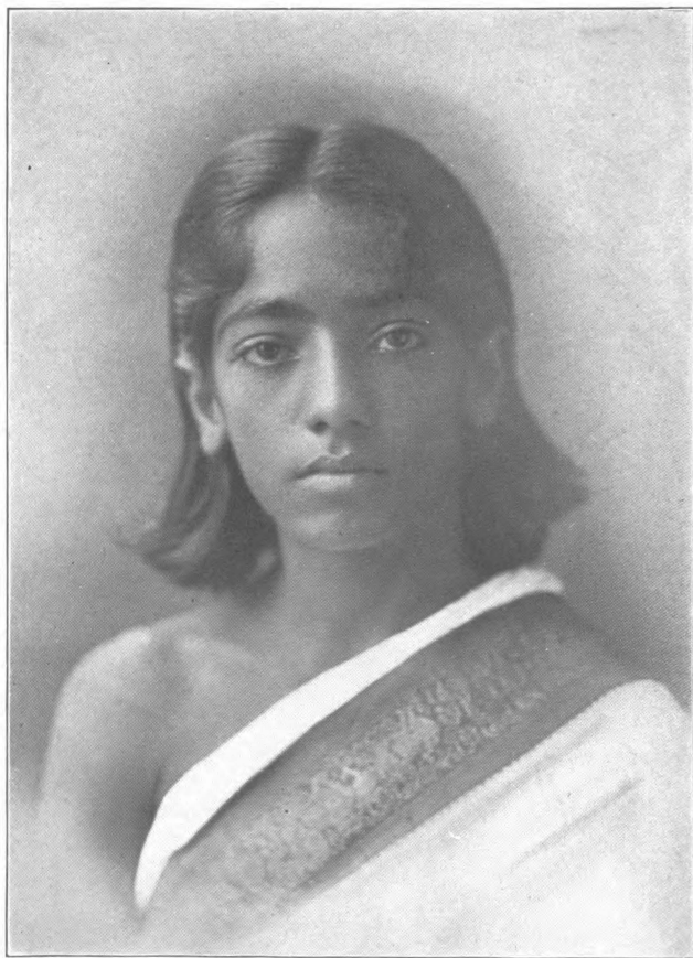
J. Krishnamurti Alcyone