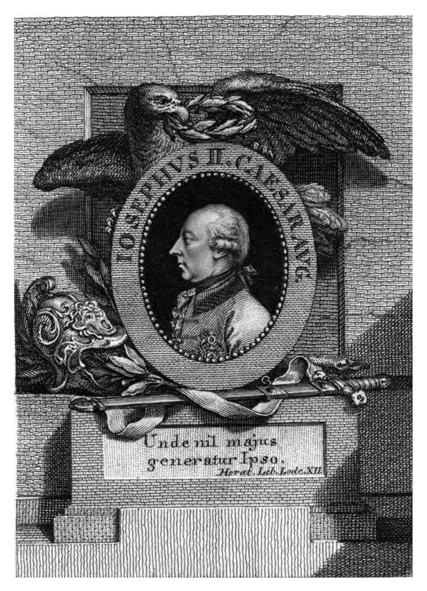
Figure 8.1 Joseph II by Jakob Adam, 1782.