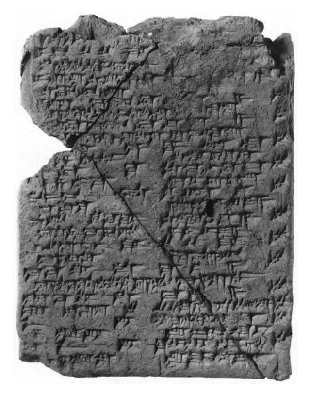
Figure 2.1 A Sumerian religious poem. Part of a fragmentary ms. from a Babylonian scholar's library c. 2nd century BC. The metrical caesura is marked by a gap in the centre of each line of verse. Each line of Sumerian is followed by an interlinear translation into Akkadian, indented slightly at the left-hand side.

sequently the writing on the reverse is inverted compared to that on the obverse.