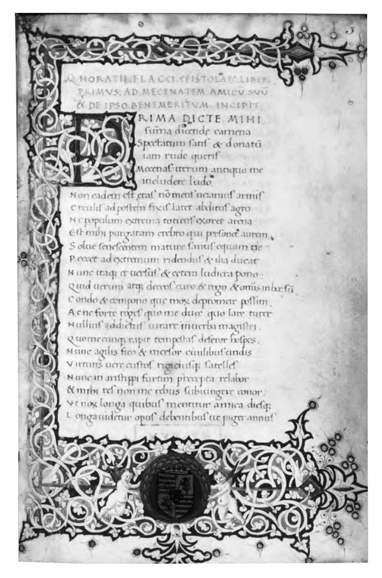
Figure 5.1 The Corvina Manuscript. British Library: Lansdowne 836. Antal Verancsics, bishop of Pecs, acquired this edition of Horace in Constantinople, at some point between 1553 to 1557. Verancsics most probably gave it to the imperial envoy, Busbeq, after which the codex made its way firstly to the Netherlands and later, in the eighteenth century, to London. See Lajos Kropf, 'A British Museum Korvin-kodexe', Magyar Konyvszemle , 1895, pp. 1–8.