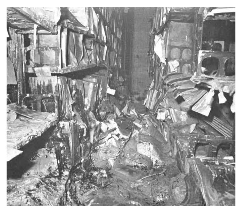
Figure 1.2(b) A ruined stack at the Biblioteca Nazionale, following the Florence flood of November 1966