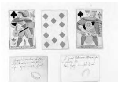
Figure 10.1 Playing cards used to catalogue books during the French Revolutionary seizures. From the Arbois Library.

then classified alphabetically by authors, or by titles for anonymous works. The playing cards were then linked together by string so that no card could be lost. Once all this was done, the details from the cards had to be copied out in a register intended to serve as an on-the-spot catalogue of the library. After that the playing cards were all sent to Paris, to the bibliographical office, to feed the national catalogue in progress.