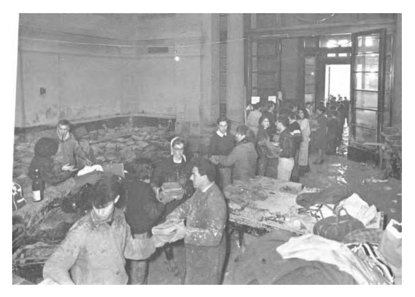
Figure 1.2(a) A human chain rescuing books at the Biblioteca Nazionale, November 1966