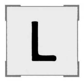
lackadaisical for something done without enthusiasm. Not lacks -.

La Guardia Airport. New York. It is worth noting that some users make the name one word, as in Fiorello H. LaGuardia Community College in Queens, but the two-word form is more general for both the man and any entities named for him, particularly the airport. For the record, Fiorello Henry La Guardia (1882–1947) was a U.S. congressman from 1917 to 1921 and 1923 to 1933 and mayor of New York City from 1934 to 1945.