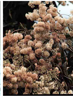
9 Cordia alliodora BORAGINACEAE