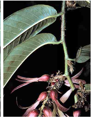
30 Triplaris poeppigiana POLYGONACEAE