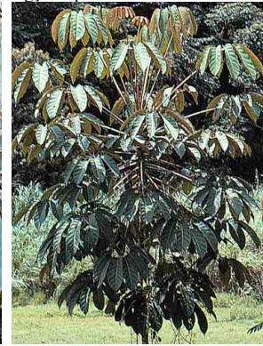
4 Schefflera morototoni ARALIACEAE