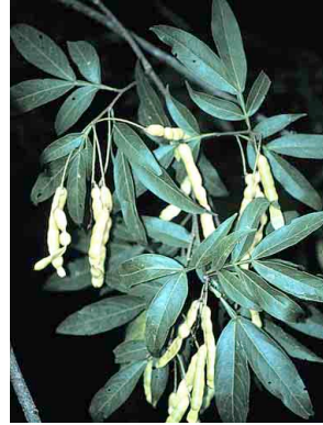
24 Inga marginata FABACEAE