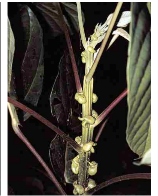
20 Hyeronima alchorneoides EUPHORBIACEAE