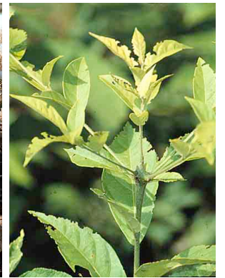
10 Cordia alliodora BORAGINACEAE