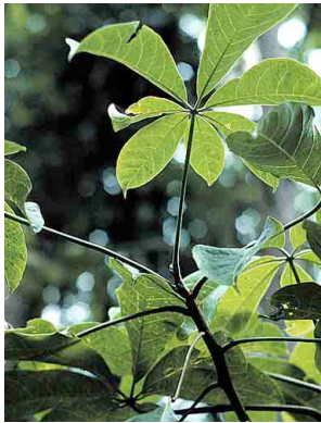
11 Jacaratia digitata CARICACEAE