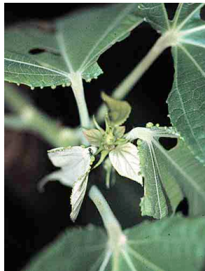
38 Heliocarpus americanus TILIACEAE