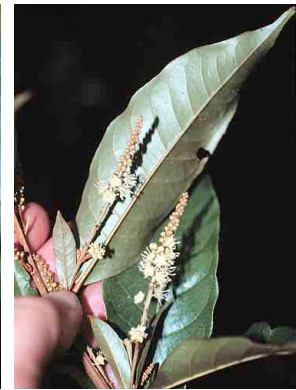
19 Croton EUPHORBIACEAE