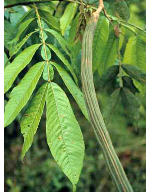
23 Inga edulis FABACEAE