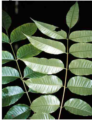
2 Spondias mombin ANACARDIACEAE