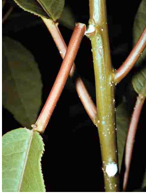
22 Sapium aucuparium EUPHORBIACEAE