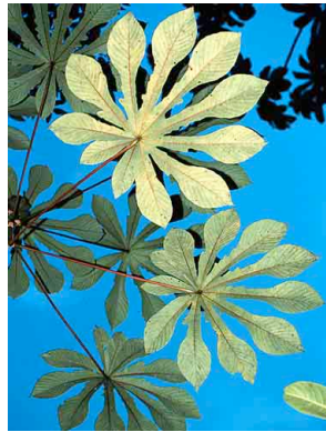
13 Cecropia polystachya CECROPIACEAE