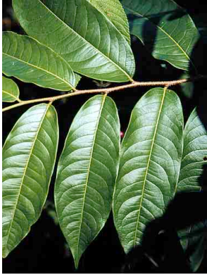
21 Margaritaria nobilis EUPHORBIACEAE