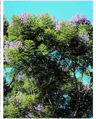
5 Jacaranda copaia BIGNONIACEAE