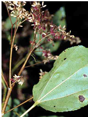
37 Heliocarpus TILIACEAE