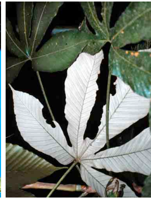
14 Pourouma bicolor CECROPIACEAE