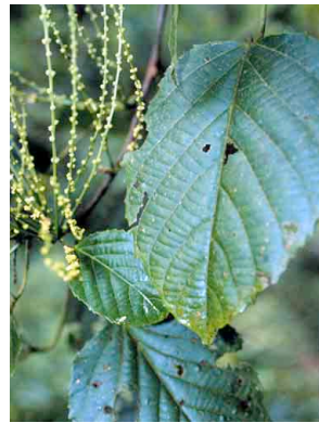
18 Aparisthium cordatum EUPHORBIACEAE