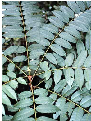
28 Cedrela fissilis MELIACEAE