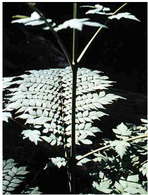
6 Jacaranda copaia BIGNONIACEAE