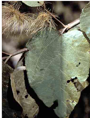
33 Guazuma crinita STERCULIACEAE