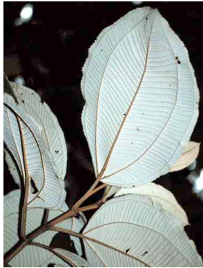
27 Miconia elata MELASTOMATACEAE