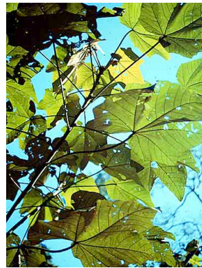
8 Ochroma pyramidale BOMBACACEAE