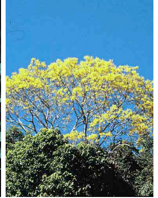
25 Schizolobium parahybum FABACEAE