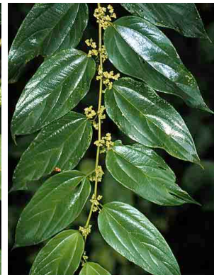
40 Trema micrantha ULMACEAE