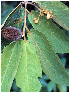
36 Apeiba tibourbou TILIACEAE