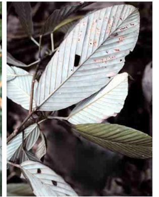
15 Pourouma minor CECROPIACEAE