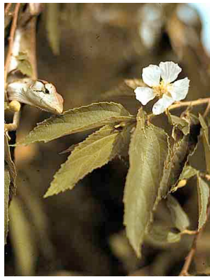
17 Muntingia calabura ELAEOCARPACEAE (MUNTINGIACEAE)