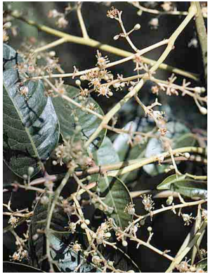
1 Spondias mombin ANACARDIACEAE

Producido por: R. B. Foster y M. R. Metz, con el apoyo del Andrew Mellon Foundation © Environmental & Conservation Programs, The Field Museum, Chicago, IL 60605 USA. [RRC@fmnh.org] Rapid Color Guide # 16 version 1.3