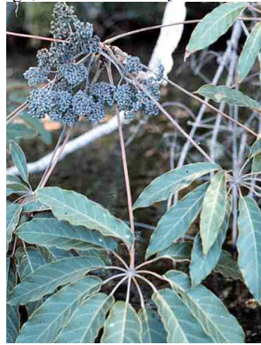
3 Schefflera morototoni ARALIACEAE