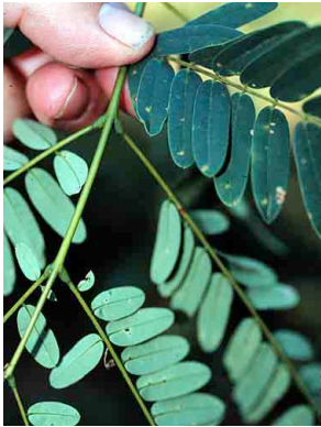
26 Schizolobium parahybum FABACEAE