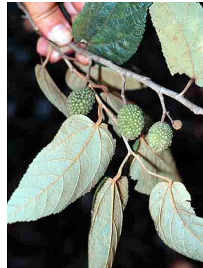
34 Guazuma tomentosa STERCULIACEAE