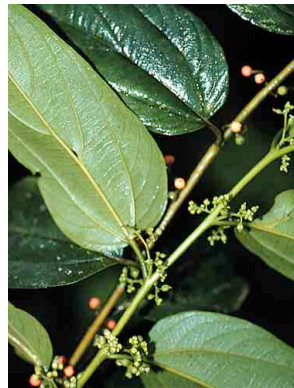
39 Trema micrantha ULMACEAE