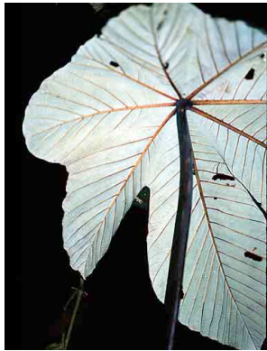
12 Cecropia CECROPIACEAE