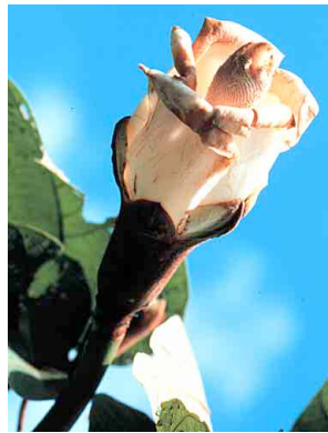
7 Ochroma pyramidale BOMBACACEAE