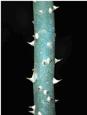
31 Zanthoxylum RUTACEAE