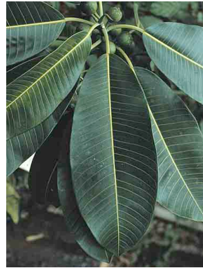
29 Ficus insipida MORACEAE