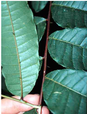
32 Zanthoxylum RUTACEAE