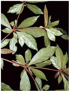
16 Terminalia amazonia COMBRETACEAE