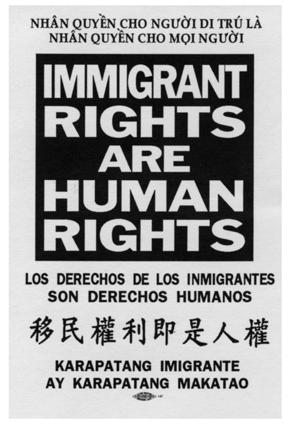
FIGURE 1. This three-by-four-inch sticker was worn by demonstrators in Sacramento. The slogan was reproduced on t-shirts, posters, and handouts.

and for all poor Californians. Coalition organizers had developed a movement platform, "Immigrant Rights Are Human Rights," framed in bold letters in five languages, displayed on posters, t-shirts, and large signs. Immigrants from all over the world stood together, but the two most visible groups were Asian and Latinas/os. And elderly Asian immigrant women held signs that read "YOUR $$1 CUT IS KILLING US!!!"