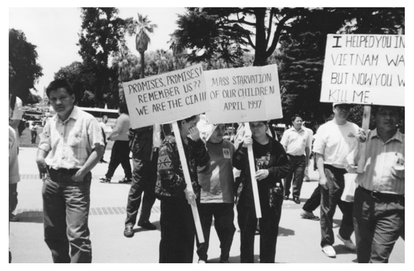
FIGURE 2. The Sacramento Immigrant Day II march marked the 100-day countdown to the Supplemental Security Income cut for noncitizens. The sign slightly cut off on the right reads "I HELPED YOU IN THE VIETNAM WAR BUT NOW YOU WANT TO KILL ME."

present, the historical and political experiences of the thousands of refugees from Southeast Asia who had fled from genocide resonated with conflicted perceptions of American involvement in the war in Vietnam.