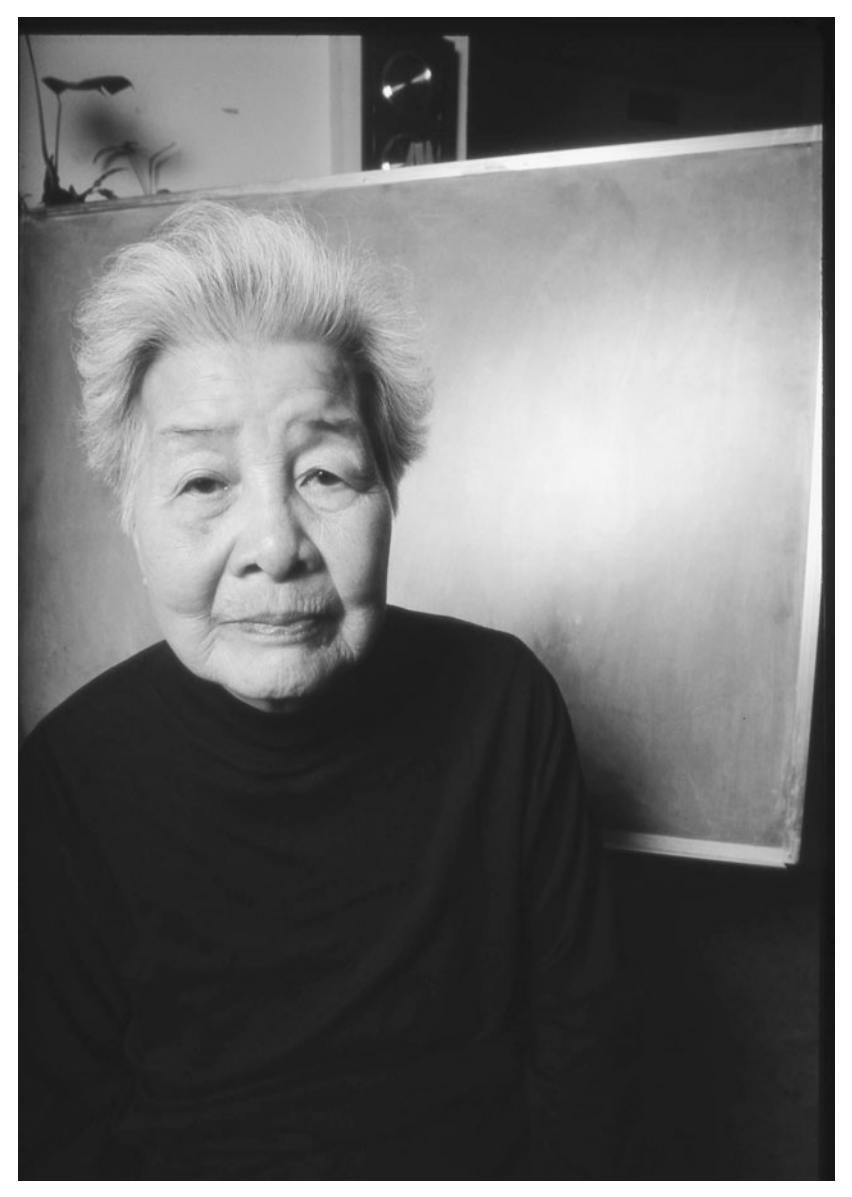
FIGURE 3. This photograph appeared on the front cover of San Francisco Weekly , February 12–18, 1997.