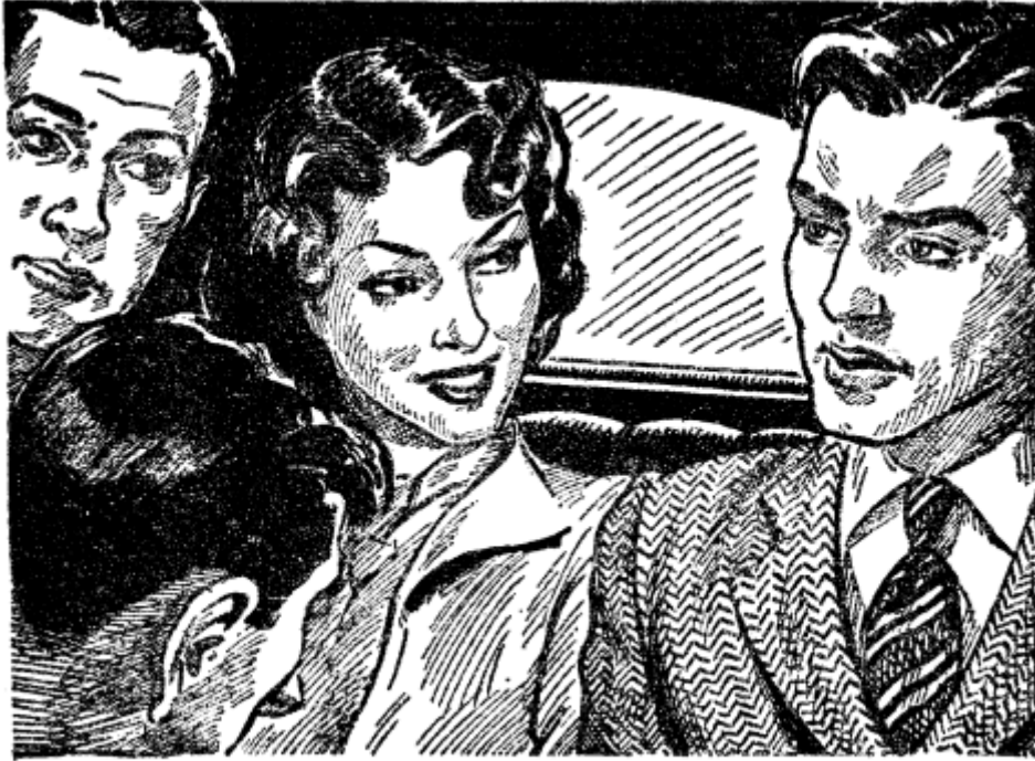
The girl sat between Doc Savage and Ham, while Monk, who rode in one of the jump seats, sat sideways and told Doc what happened aboard the cruiser.