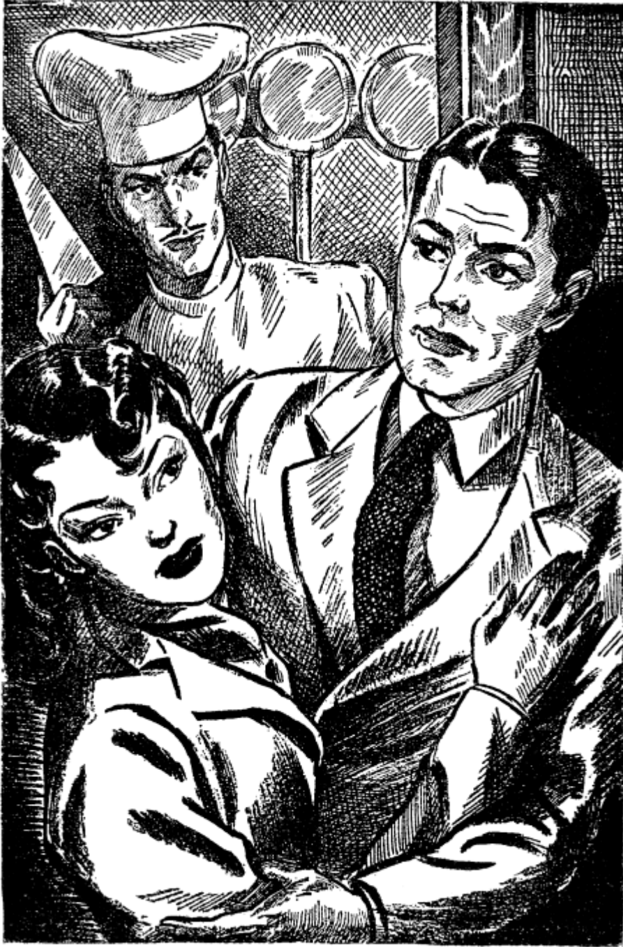
The man with the long-bladed, heavy sandwich-knife came across the service pantry and called out, "Say!"

The man came forward to investigate further, just as the redhaired girl slipped past him. She was gone in the time it took the chef to exclaim, "Say!" again. He blocked the lawyer's path. Also, he saw the silver creamers on the storeroom floor and started to look mad about that.