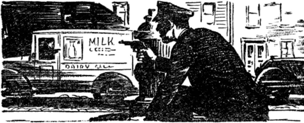
A man leaned out of the dairy truck and shot at the policeman. The cop jumped behind a fire hydrant, getting out his gun.

"Good guess!" Ham yelled. "There go both cars."