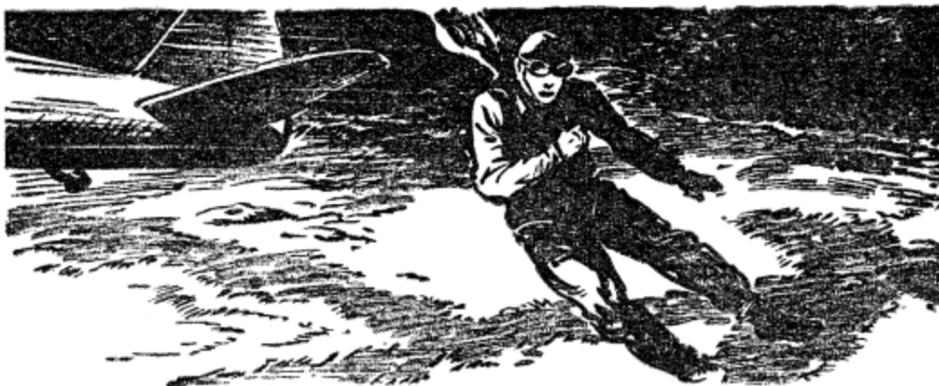
She jumped, the parachute pack dangling on its straps, her hand on the ripcord.

Renny twisted his head around and watched to make sure she landed safely. By that time, he had overshot his landing, so he hauled up the nose and went around again. That time he set the plane down without trouble.