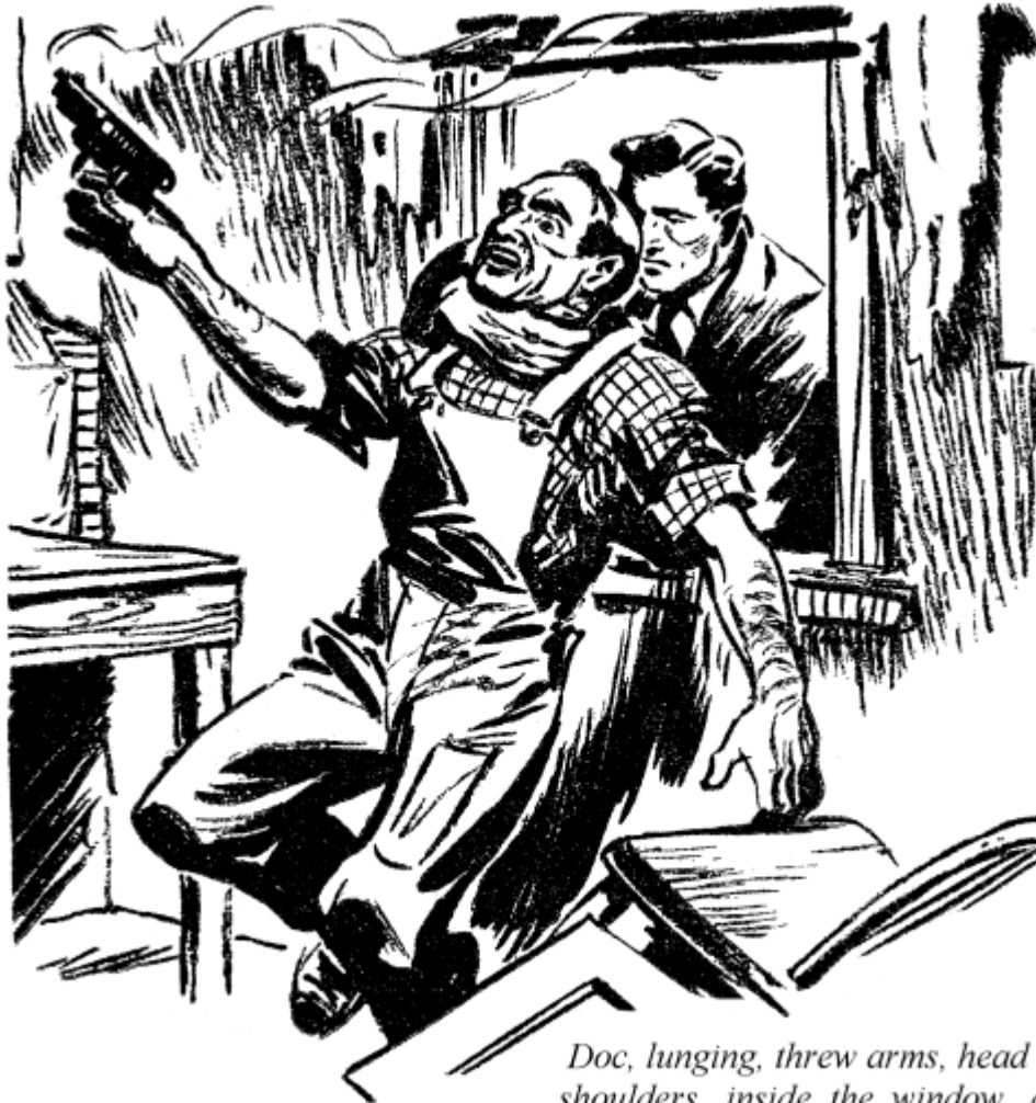
Doc, lunging, threw arms, head and shoulders, inside the window, and seized the man.

him," Chadwick said. "The others weren't necessary."