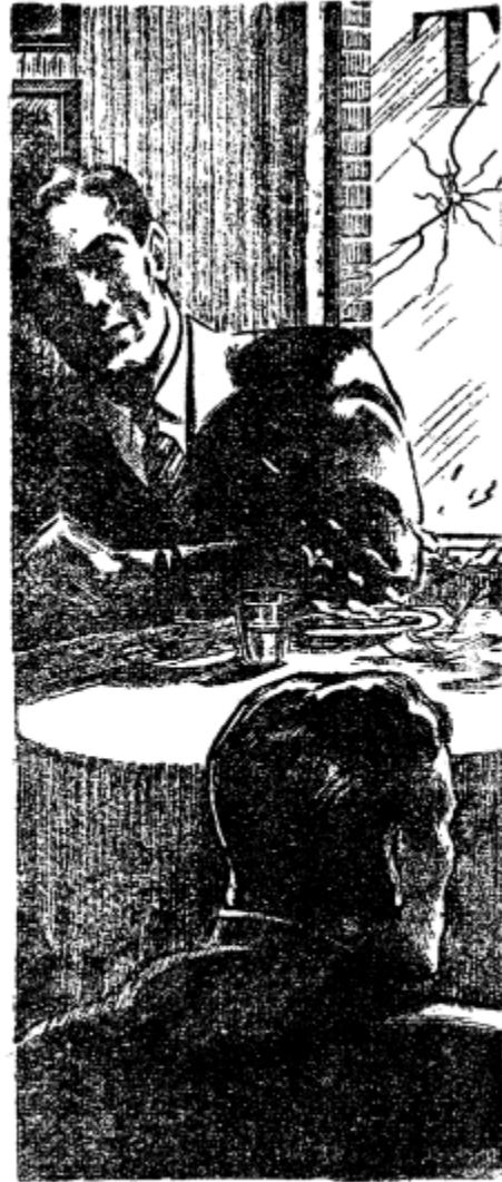
The rifle bullet came into the restaurant and made all the commotion he had hoped for.

Monk Mayfair was a squat, four-by-fourish sort of an individual with a startlingly homely face, a considerable growth of wiry red hair that was as thick elsewhere on him, namely his forearms, as it was on his bullet head. Apparently he had gone to considerable trouble to dress as sloppily, and also as loudly, as possible. Sam, remembering Monk Mayfair was reputedly one of the world's great industrial chemists, was startled.