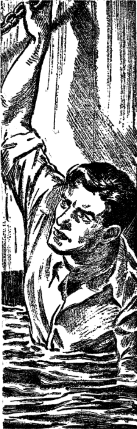
The heavy chain bobstay of the schooner was close enough to reach. He laid hold of it.

gle in the water, so the wetness from his clothing would drain off silently.