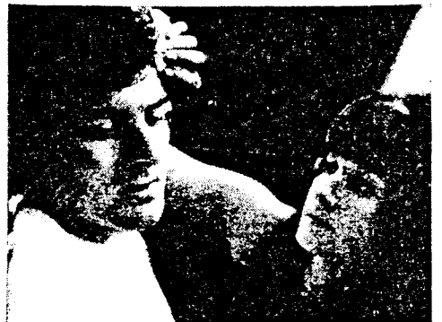
Peter Purves as Steven and Adrienne Hill as Katarina