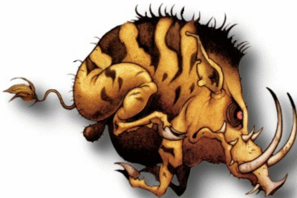
Another Bush Pig Production - 2005