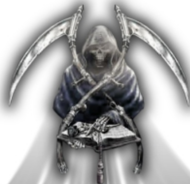
REAP The BENEFITS OF MY DEEDS