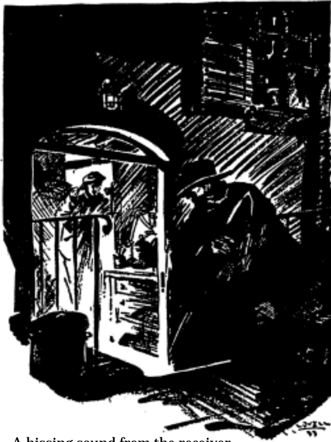
A hissing sound from the receiver was plain to The Shadow's ears.

C LIFF MARSLAND opened his eyes. He was lying on a cot, in one of the strangest rooms that he had ever seen. Near him was a table and a chair; beyond that, a large cabinet projecting