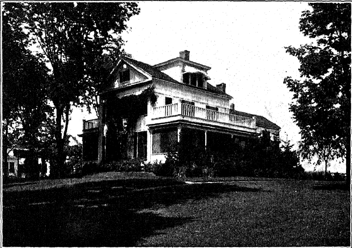
Miss Keller's home at Wrentham. Above, the entrance, showing the stone wall which Miss Keller helped build.