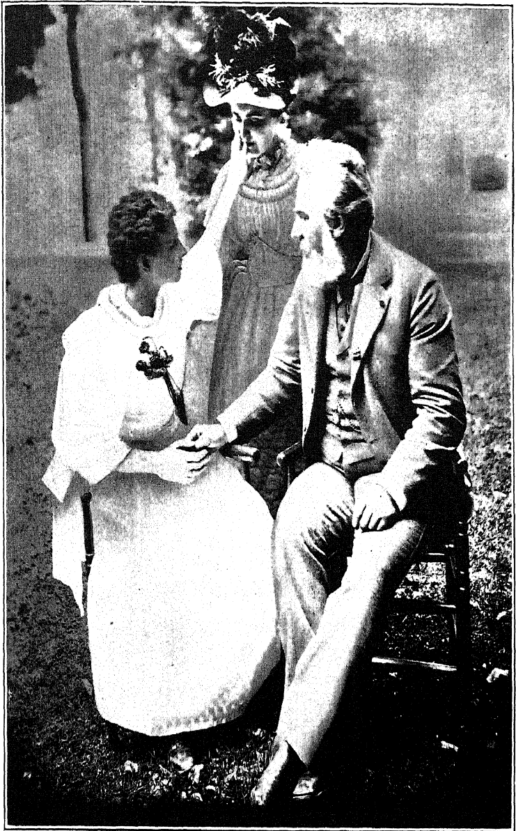
Miss Keller, Miss Sullivan and Dr. Bell, Nova Scotia, 1901.