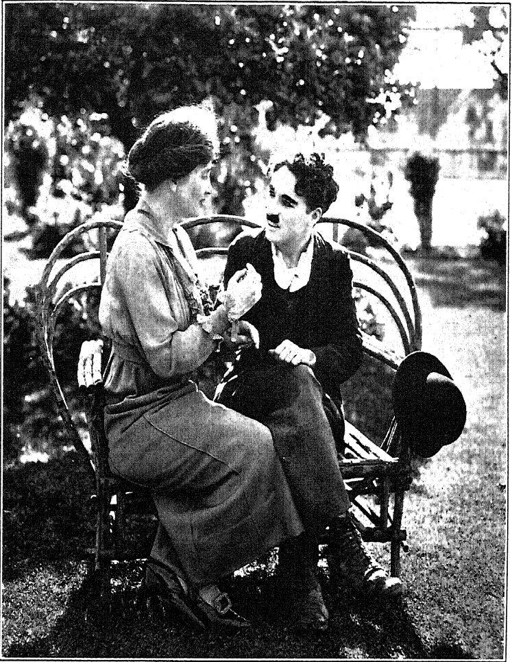
Miss Keller teaching Charlie Chaplin the manual alphabet.