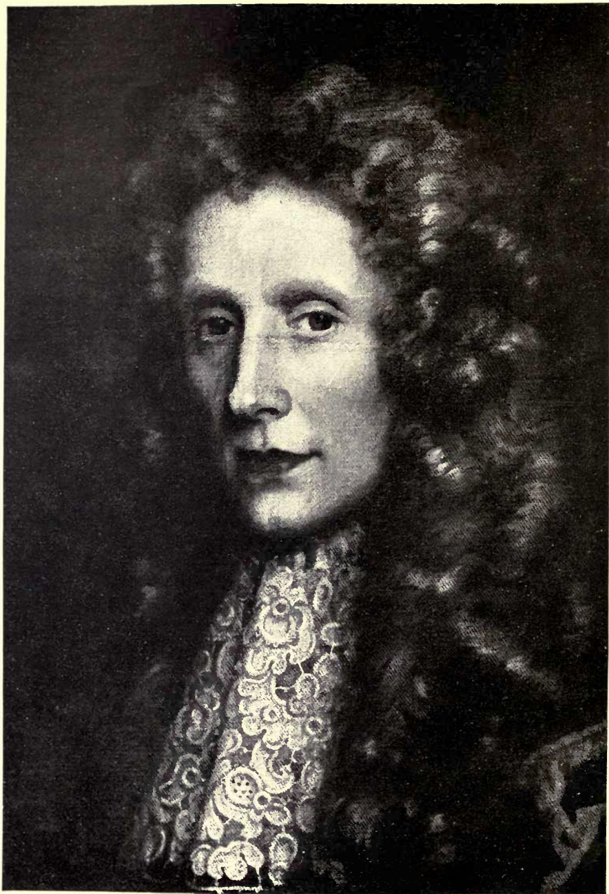
THE HONOURABLE ROBERT BOYLE From a painting by Kerseboom, in the rooms of the Royal Society.