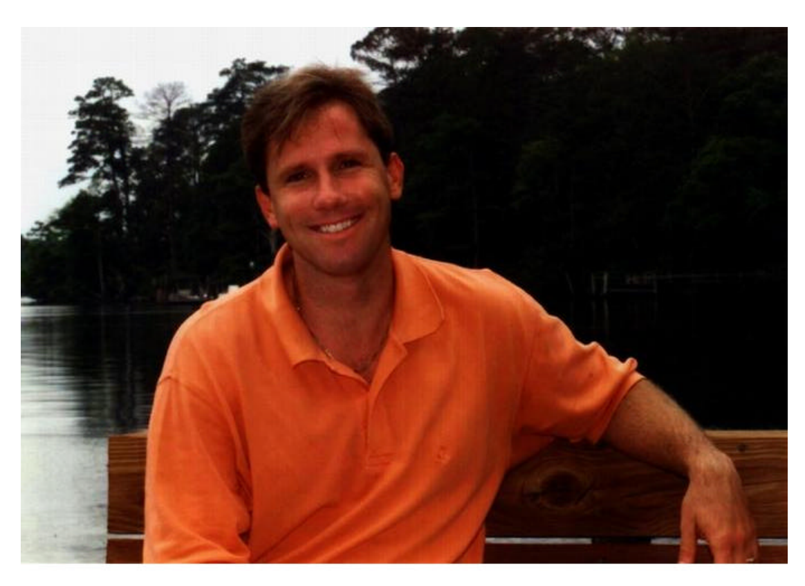
The Author : Nicholas Sparks