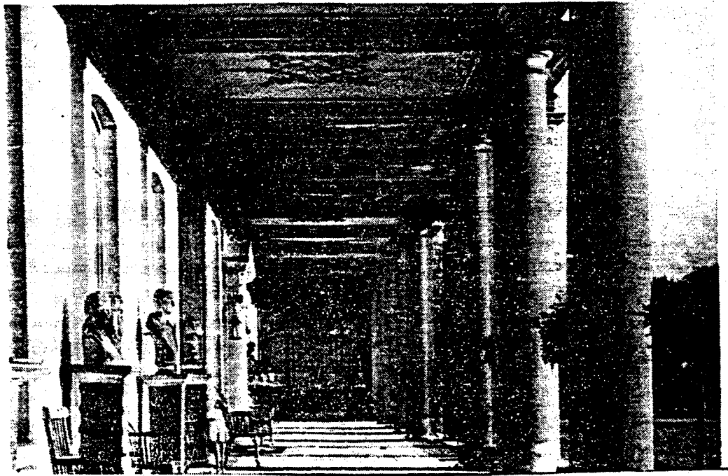
Porch of the House of "Hell Fire Francis".