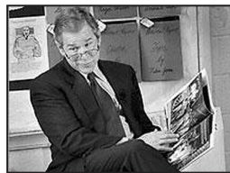
George W. Bush at Booker Elementary

“Please explain why you remained at the Sarasota, Florida, Elementary School for a press conference after you had finished listening to the children read, when as a terrorist target, your presence potentially jeopardized the lives of the children?”