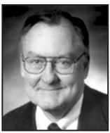
James R. Thompson

is also close to several members of the current Bush government. Along with Kean, Hamilton, and Gorelick, he is a member of the Council on Foreign Relations (CFR).