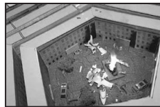
Pentagon Mass Casualty Exercise - Oct. 24, 2000

ISSUE #2 – On October 24, 2000, a mass casualty ( M A S C A L ) emergency drill was conducted to test the Pentagon’s response to an airliner crashing into its headquarters. In the situation room, a model plane was set aflame within a scale model of the building, while emergency crews were dispatched to various places around the real building to test their response times. A military web site later published news of the exercise, with pictures. What did then Defense Secretary William Cohen tell his successor, Rumsfeld, about this drill during the transition process from the Clinton to Bush administrations?