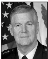
Richard B. Myers

She went on to ask specific questions about when an order to authorize fighter pilots to shoot down aircraft was issued on the morning of September 11. Rumsfeld complicated and confused the question by shifting the focus to later in the day and describing how the events of the day modified the rules of engagement.