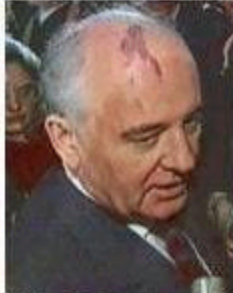
Roths child Rockefeller Wealthy & powerful friends.

5 months and 2 days later: Mikhail Gorbachev on April "11"th, 1990 announces "We are only beginning to shape the New World Order."