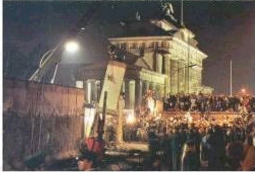
Berlin Wall falling on "11-9"-1989 6:30pm Elite families: Duponts, Freemans, Reynolds, Onassis, Merovingians, Bundys, Warburgs, Russells, Mellons, Carnegies, Dukes, Astors, Paynes, Bakers, Tukes, Cullmans, Winthops, Milners... Exactly "11" years later to the hour:

Numerology is important to the conspirators... (3,6,7,"11",13,19,39,93,666) Faith in the Father and Son gives hope to the believers.