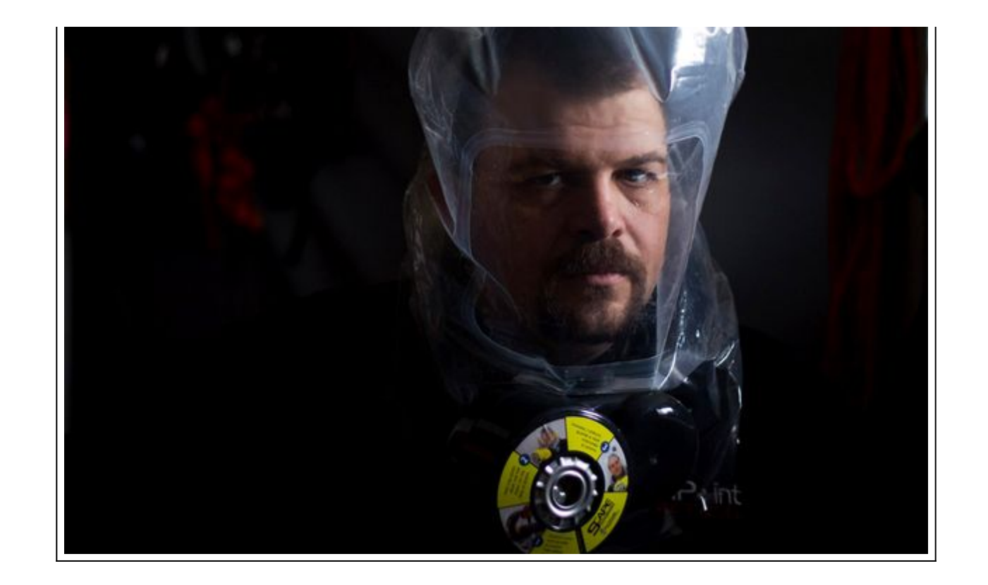
Gas mask: Purifier air kit for Preppers

"If someone comes into my store and threatens me with a weapon I am not going to tell them to go away simply with good intentions.