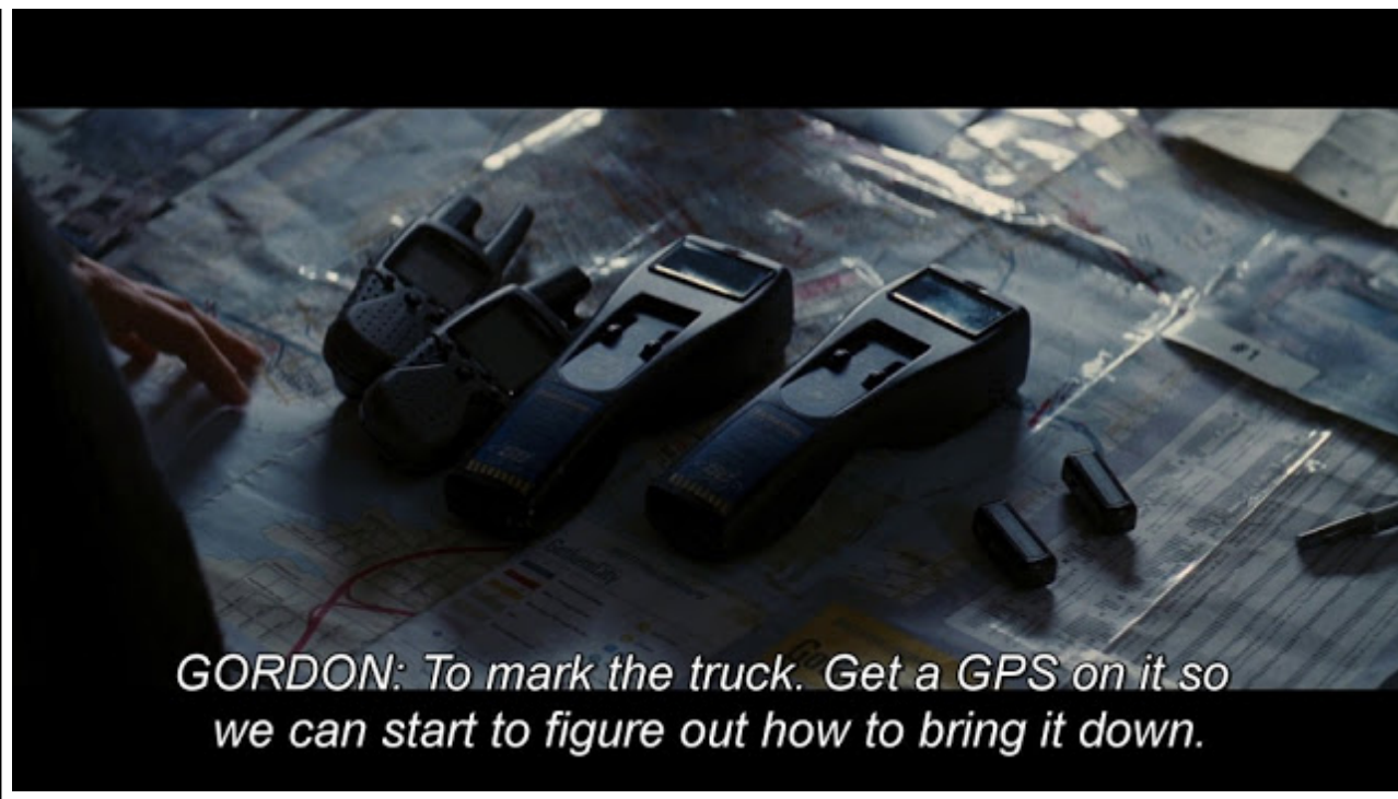
Above his hand where he is pointing to is "Sandy Hook"