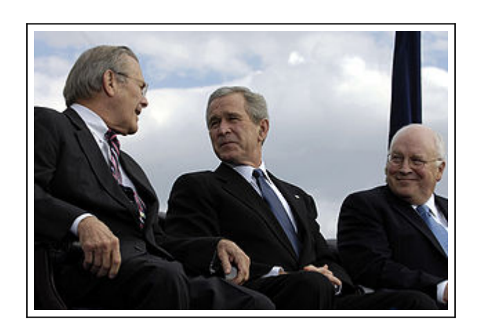
Ruling cabals of USA.

The US is today, albeit temporarily, the world's foremost power. It is a country whose people are blessed with wonderful qualities of the head and heart. They are honest, hardworking problem solvers, large-hearted, decent and deeply innocent. The emergence of the US as a power with the greatest ever reaches in human history is the result of a conscious and sustained effort on the part of Washington to make America a great power.