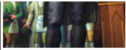
Freemason/Secret Society Member (Founding Father) George Washington

these elite have already made up their minds a very long time ago about what they have to do with the masses of humanity. They came to the decision that these Useless Eaters Must Go! Read the Georgia GuideStones . Then check out this youtube video New World Order: Blueprint of Madmen - a documentary on population control by governments.