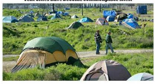
Should we be getting ready for major climate changes and a global depression?

And on top of all of this, were now in a new Great Depression! Tent Cities have become commonplace sites.