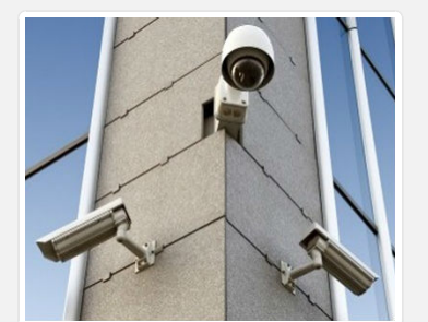
Security cameras in N.Y. city.