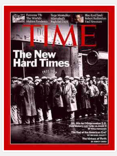
Time Magazine 13 Oct. 2008

The NYSE. The world's largest stock exchange market. US stocks plunge amid Wall Street crisis - 29 Sept 08.