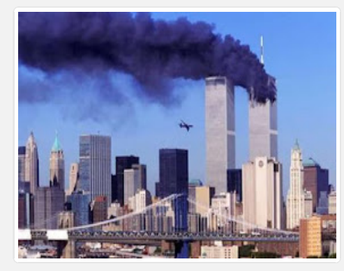
9-11 False Flag Attacks

The USA PATRIOT Act broadly expands law enforcement's surveillance and investigative powers and represents one of the most significant threats to civil liberties, privacy and democratic traditions in U.S. history. The Patriot Act gives sweeping search and surveillance to domestic law enforcement and foreign intelligence agencies and eliminates checks and balances that previously gave courts the opportunity to ensure that those powers were not abused. The Patriot Act and follow-up legislation threatens the basic rights of millions of Americans.