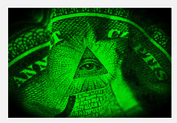
The Eye In The Pyramid