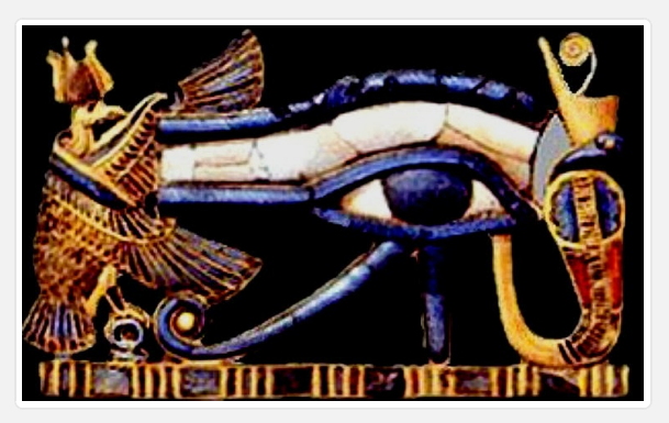
The Eye Of Horus (Osiris)