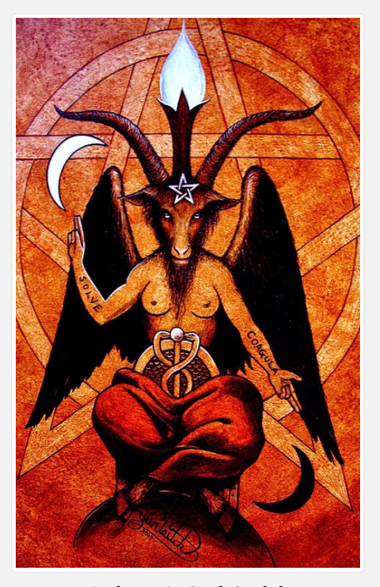
Baphomet An Occult Symbol

The coming one world government is being set up in the political arena under the flag of the United Nations, through organizations such as the Trilateral Commission, Council of Foreign Relations, the Royal Institute of International Affairs, the Bilderbergers, and the Club of Rome whose members include many world leaders, media personalities