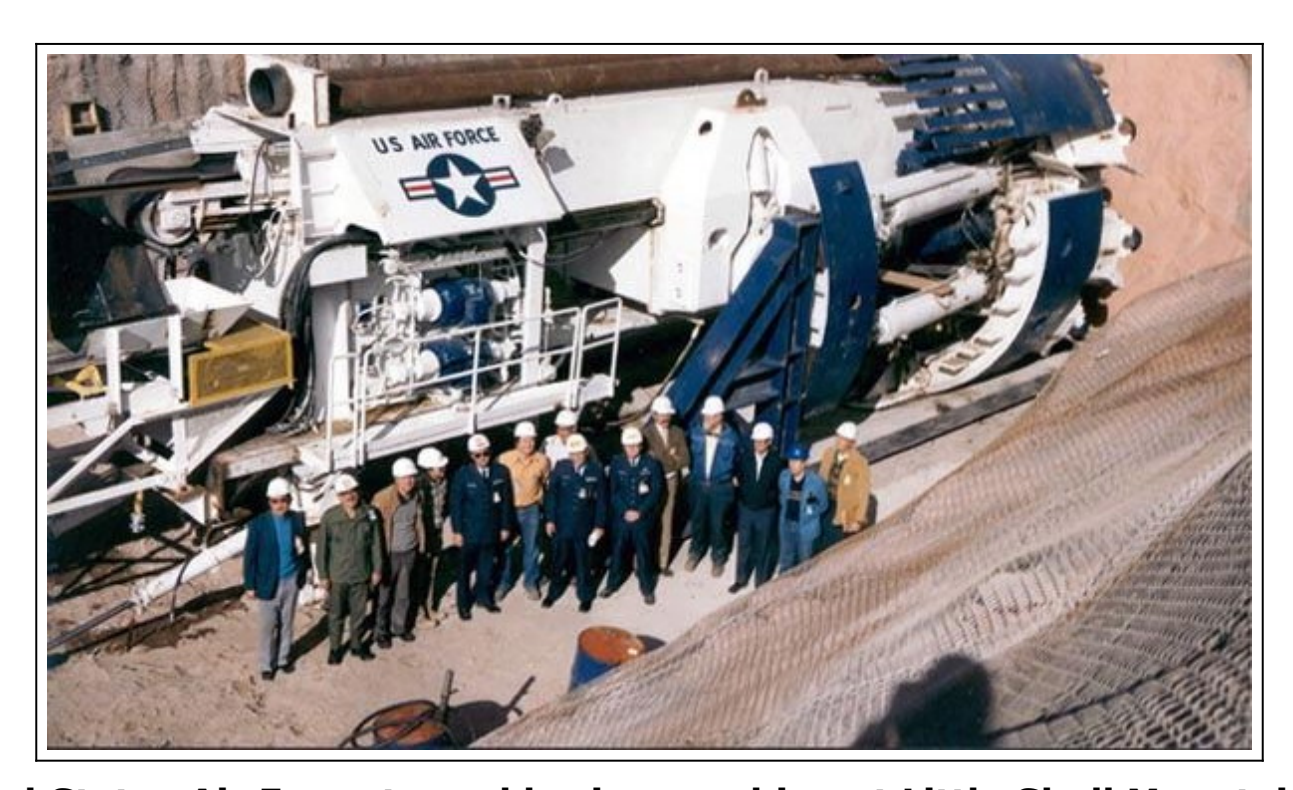
Photo of United States Air Force tunnel boring machine at Little Skull Mountain, Nevada, USA, December 1982. There are many rumors of secret military tunnels in the United States. If the rumors are true, machines such as the one shown here are used to make the tunnels.