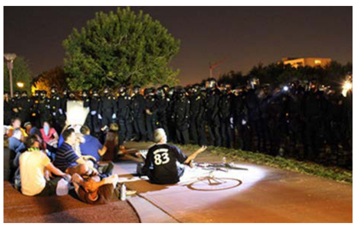
Phoenix Police Department "mobile field force" surrounds Occupy Phoenix protestors in Margaret T. Hance park on the evening of October 12, 2011.

[Note: despite the fact that public records requests submitted to PPD by DBA/CMD sought all records relating to ACTIC CLP (particularly those in possession