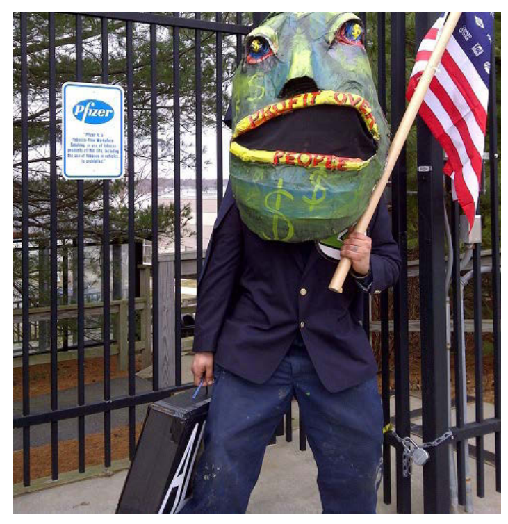
F-29 protestor outside Pfizer facility in Connecticut.

"Attendance could range from 20 to 150 demonstrators. The group plans to have giant puppets and pinatas as part of their demonstration. [paragraph break] There may be mild traffic interruptions but no significant disruptions are expected," added Dowhan.