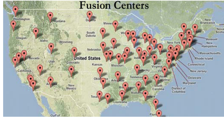
National Fusion Center Association map of fusion centers nationwide. Does not include all fusion centers.

ACTIC, commonly known as the "Arizona fusion center," was established jointly by then-Arizona Governor (and current U.S. Department of Homeland Security Secretary) Janet Napolitano and the Arizona Department of Public Safety (AZDPS) in October of 2004 . ACTIC is best described as a "counter-terrorism"/"all-hazards" resources and information sharing center, consisting of personnel from more than 25 Arizona law enforcement/"public safety" entities and 16 federal agencies. Largely, local law enforcement personnel active in ACTIC (or other state/regional fusion centers) are employed in such "homeland defense"/"homeland security," "counter terrorism," or "intelligence" units of their respective agencies. These units, by and large, were created as "counter terrorism" entities in response to the terrorist attacks of September 11, 2001. Such local entities active in ACTIC include the AZDPS Intelligence Bureau, PPDHDB, the Tempe Police Department Homeland Defense Unit, the Mesa Police Department Intelligence and Counter Terrorism Unit, and the Maricopa County Sheriff's Office. These local entities are joined through