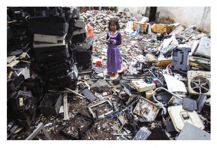
Fig. II.1 Little girl at waste dump site