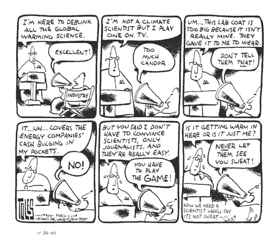
Fig. III.1 Here to Debunk