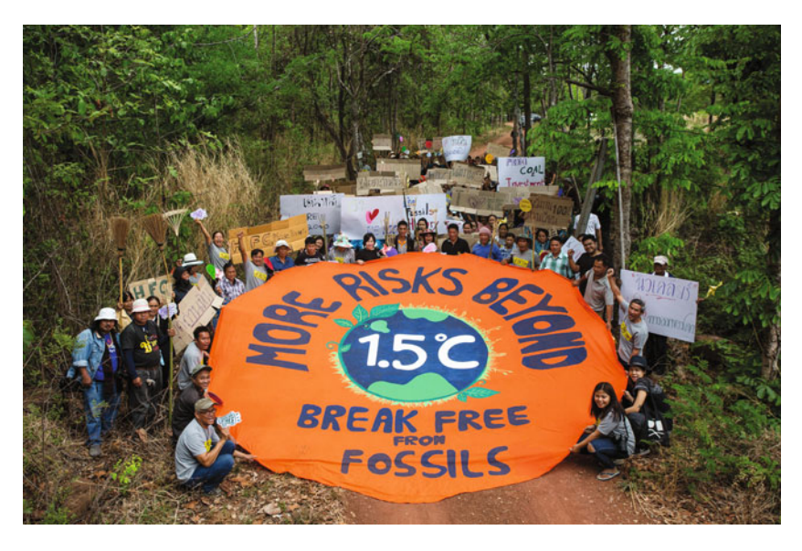
Fig. I.1 "Break Free" Protest in Thailand