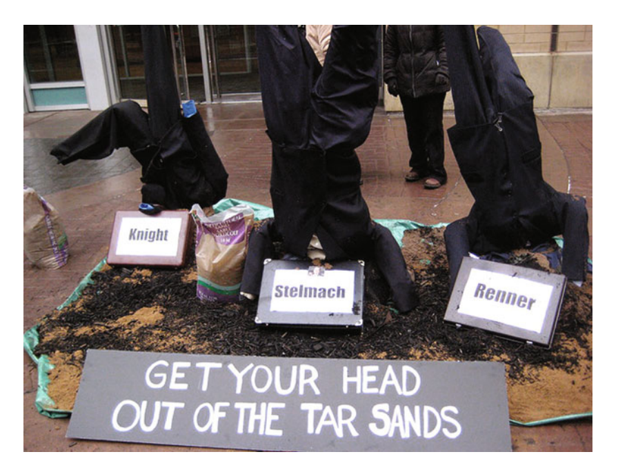
Fig. IV.1 Get your head out of the tar sands