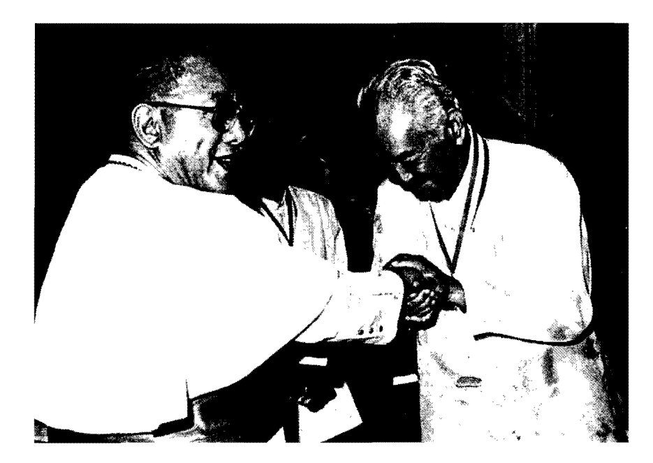
8. Central Bank Governor Jose Fernandez Jr. (1984–1990) greets Jaime Cardinal Sin, Archbishop of Manila, at a 1989 awards ceremony honoring Fernandez for assisting in the stabilization of the economy and the banking sector.

Many legislators set their sights not only upon Fernandez, but upon the very perpetuation of the Central Bank itself. As part of a reaction against the Marcos-era fiscal excesses and the overstatement of international reserves under Laya's governorship, there was strong sentiment within Congress to dismantle the Central Bank altogether and replace it with a central monetary authority (CMA) that would exercise greater independence from the executive branch. The 1986 constitution had called for the creation of an independent CMA, and many in both the House and Senate were determined to follow through. Since the legislators mandated that the new entity's budget would be subject to congressional approval, however, it would have done little to provide the CMA with any degree of