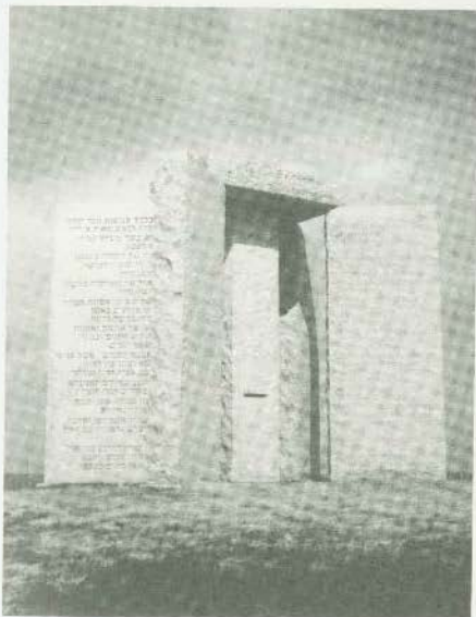
The Georgia Guidestones