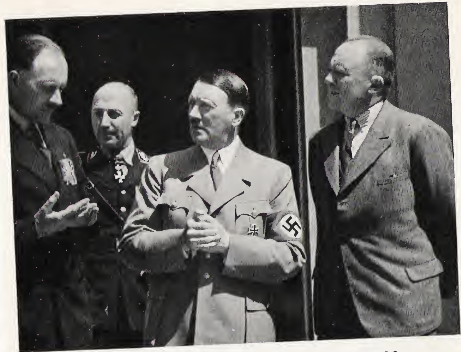
Hitler speaks with a Delegation of British Ex-Service Men

As the President's regular period of office was nearing its end a step was taken which brought Hitler into the foreground in negotiations with certain persons in the Reich Government. Chancellor Brüning endeavoured to get Hitler to consent to