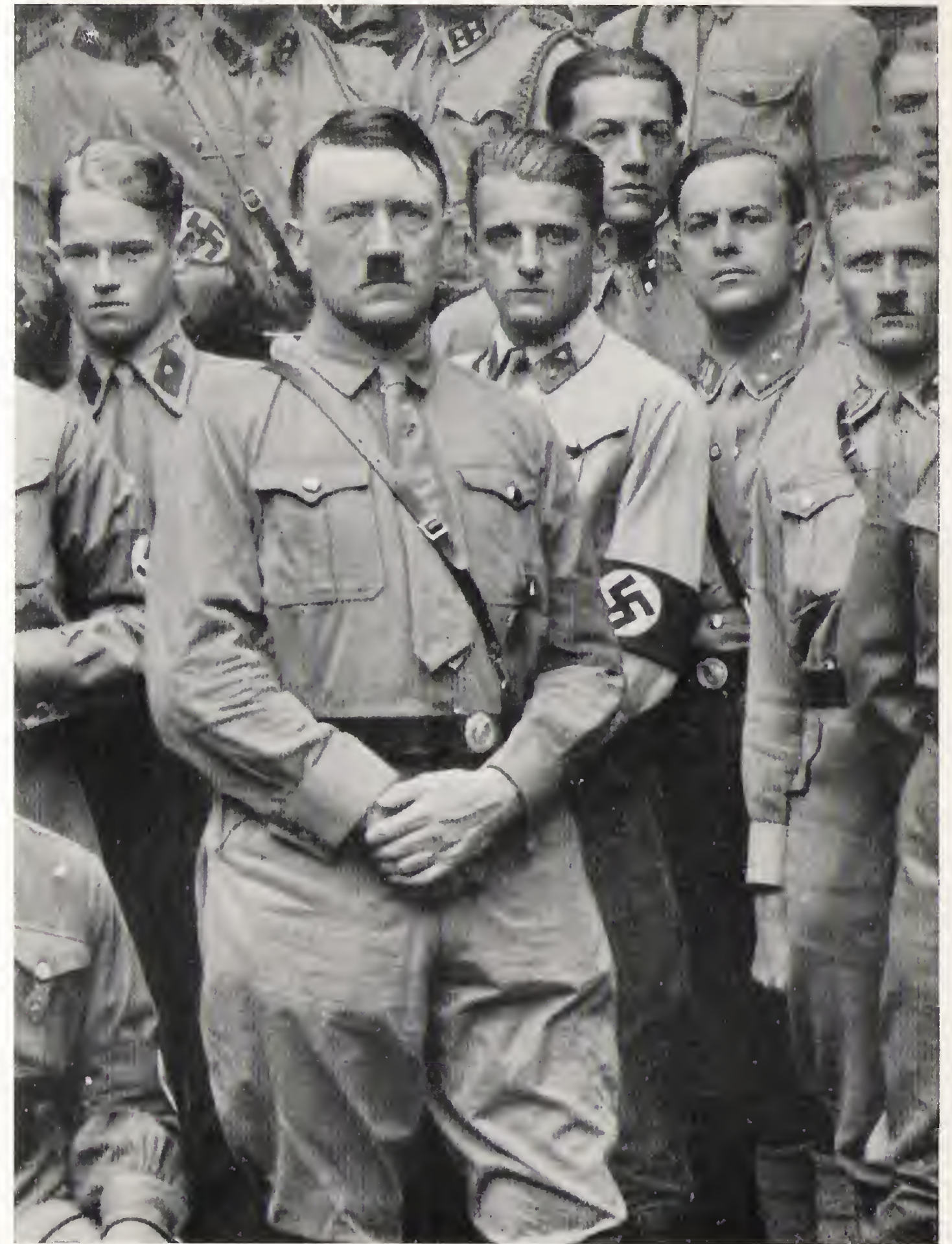
The fifteen years through which we struggled for power, amidst continual persecution and oppression on the part of our adversaries, served to increase not only the inner moral strength of the Party but, above all, its capacity for external resistance.

At the same time the foundations were laid on which the Storm Detachment was subsequently established. In the beginning this detachment was simply a body of men acting as hall guards for the maintenance of order at meetings; but it has been known as the Storm Detachment ( Sturm Abteilung , hence S.A.) ever since November 4, 1921. On that day the Party held a meeting in the banquet hall of the Munich Hofbräu Haus. The Reds turned up in force for the purpose of crushing out the new movement once and for all. But they met with a bitter disappointment. As the meeting progressed the opposition raised an outcry and a furious fight ensued. Though the Marxist