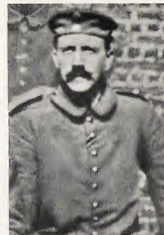
The Nameless Soldier

Though the years spent in Vienna meant a hard and bitter struggle with life, the experience gained in this school was of inestimable value afterwards. Hitler was now yearning to live as a German in Germany itself, free from the oppression under which the German element had to suffer in that potpourri of nations which made up the Habsburg Empire. So he left Vienna and came to live in Munich. That was on April 24, 1912.