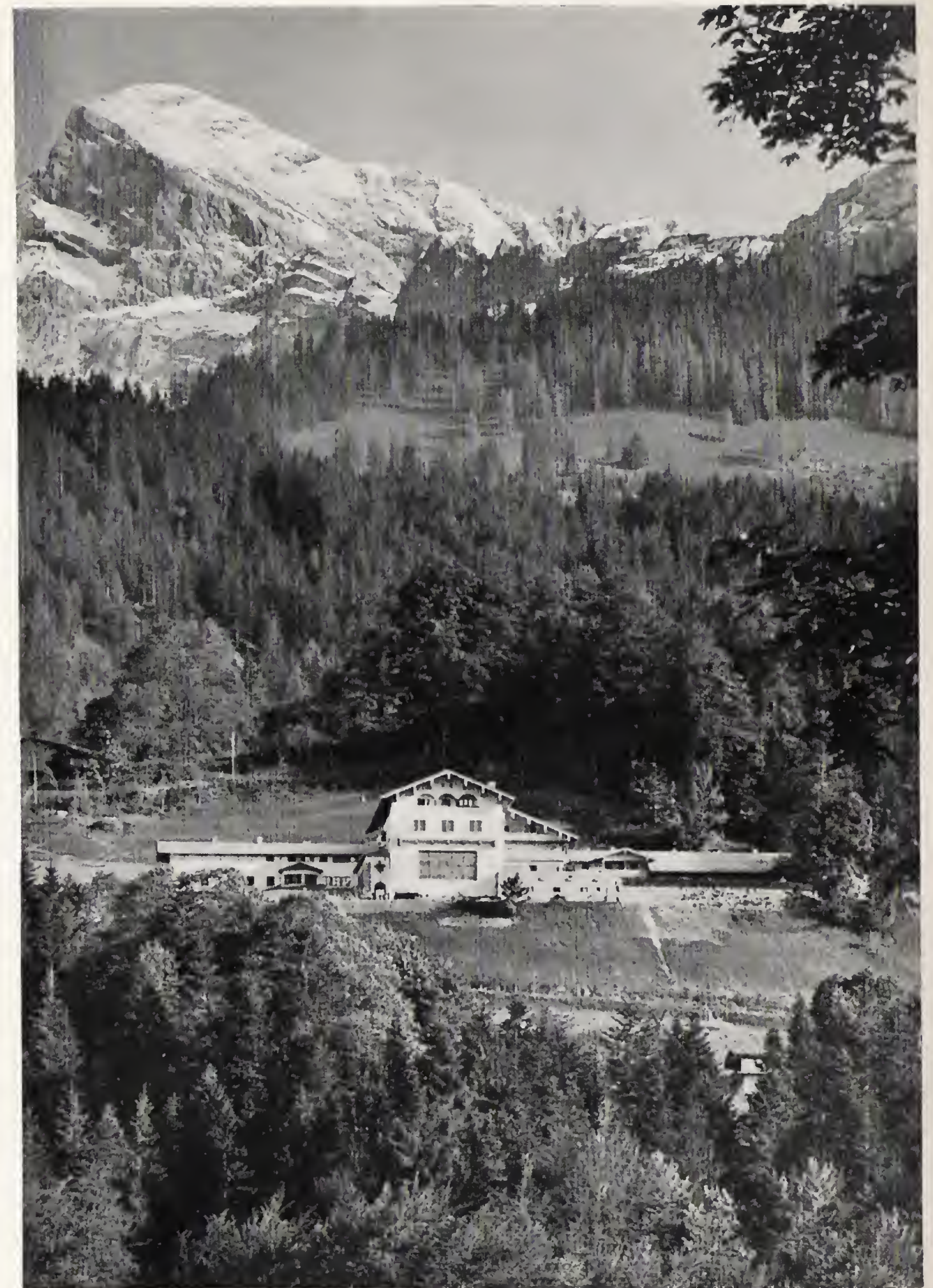
THE BERGHOF Hitler's House on the Obersalzberg

A fresh election was held on November 6. This time the result showed a reduction from 13,400,000 to 11,800,000 of the votes cast in his favour. There was a corresponding reduction in the number of National Socialist deputies, from 230 to 196. Hitler's opponents were jubilant over the result. Hitler obstinately refused to be satisfied with the Vice-Chancellorship and the Government adopted a dictatorial attitude on the other side. The situation which thus resulted created among many people the impression that Hitler had missed his opportunity and that his movement was weakening. But the jubilant cries of his opponents were short-lived. Hitler had the courage and firmness of mind to wait. At the end of January, 1933, the then Chancellor, General Schleicher, stood completely isolated. On January 28 his entire Cabinet resigned and on January 30 the