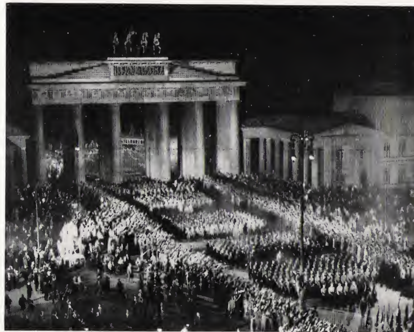
Berlin, January 30, 1937

On the same date, November 9, 1923, the General State Commissar issued an order dissolving the German National