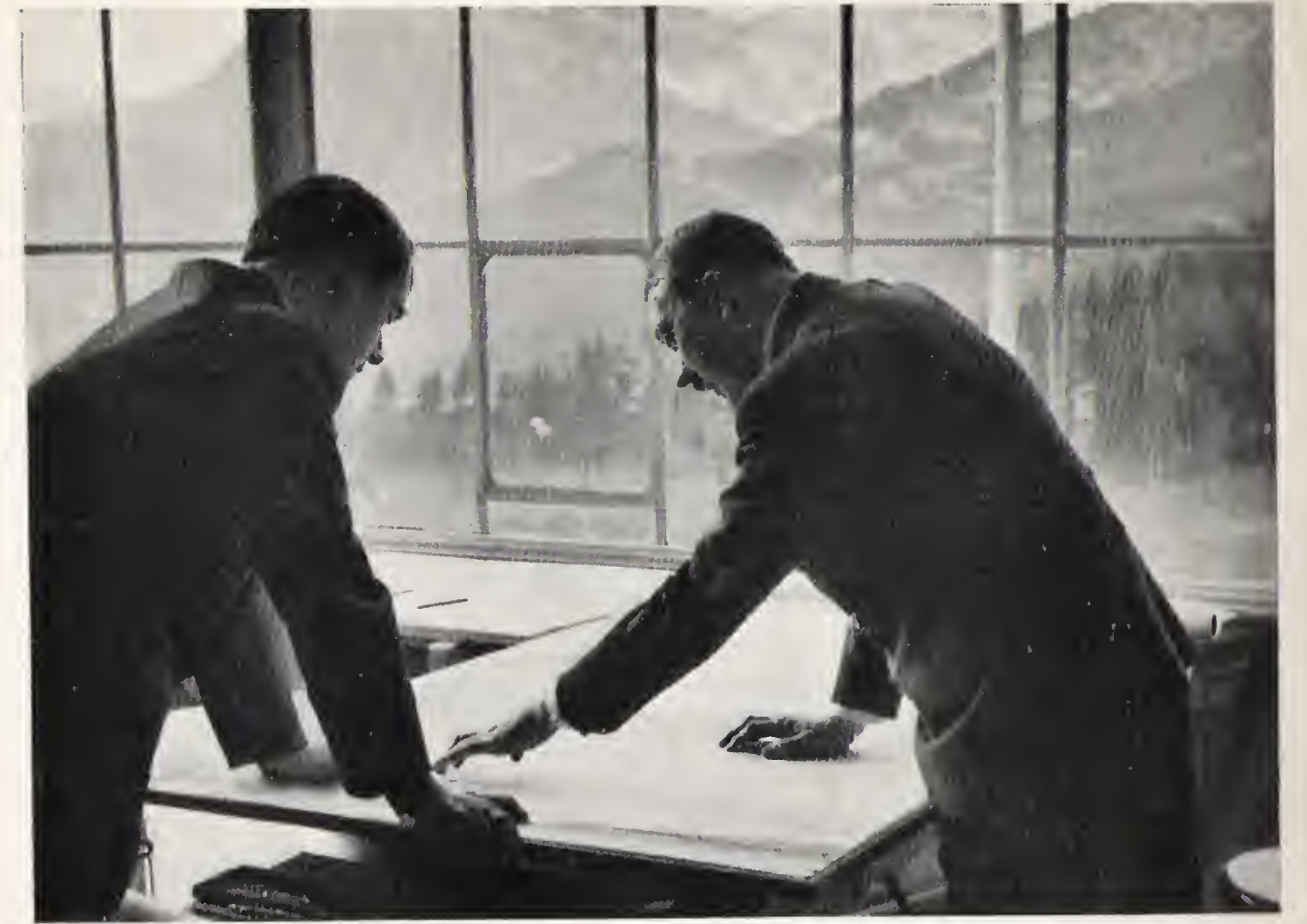
In Hitler's Studio at Obersalzberg

On March 23, 1933, the Führer asked for four years in which he could put into practice his measures for the restoration of the German nation. The law which gave him unlimited powers for this purpose was constitutionally passed by Parliament. After the expiry of this period, when he had given a public