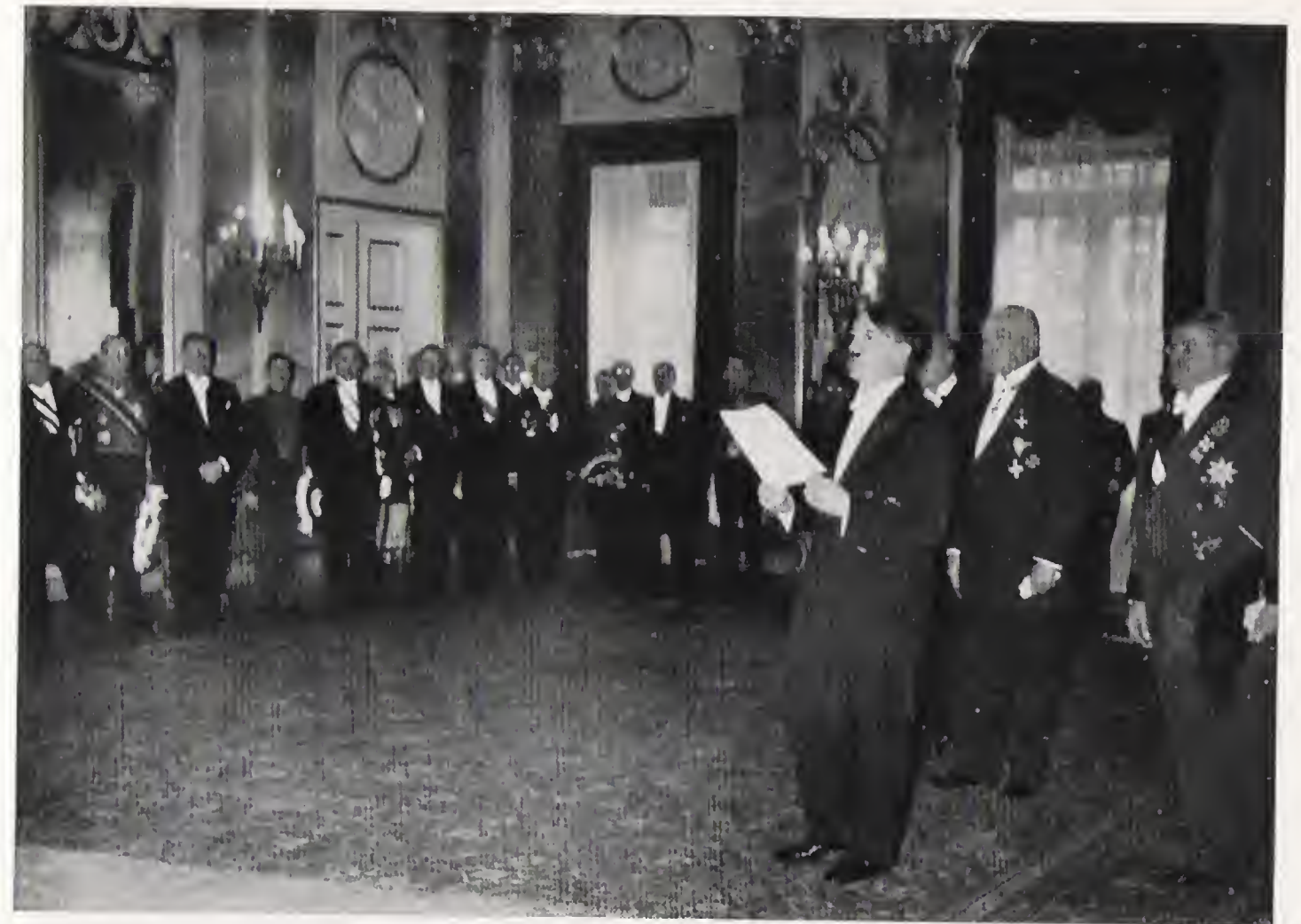
New Year Reception of Foreign Ambassadors

of Germany. On the occasion of the Party Congress in 1929 well over 100,000 persons made a pilgrimage to the old imperial city. Twenty-four new standards were presented to the S. A. following a solemn commemoration service for the dead at the War Monument in the Luitpoldhain. The march-past of the S. A. at the close of the ceremony, when Hitler took the salute, lasted close on four hours and formed an imposing demonstration.