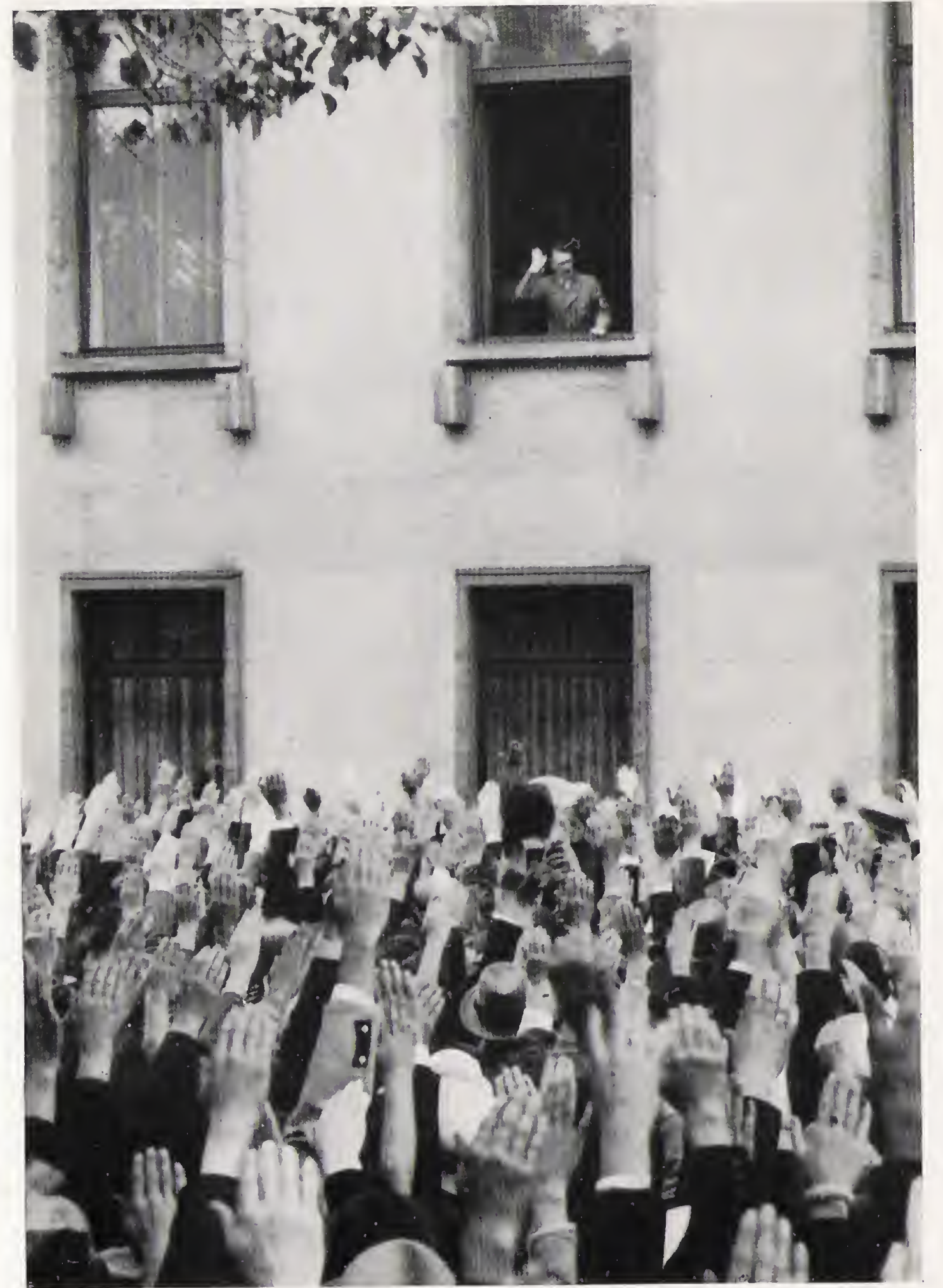
THE FÜHRER AT THE WINDOW OF THE REICH CHANCELLERY, 1934

Hitler took upon himself the full and sole responsibility for everything that had happened. Speaking in his own defence he stated in the course of a brilliant speech that the overthrow of Marxism was his aim but that this was considered essentially as a necessary pre-condition for the establishment of German