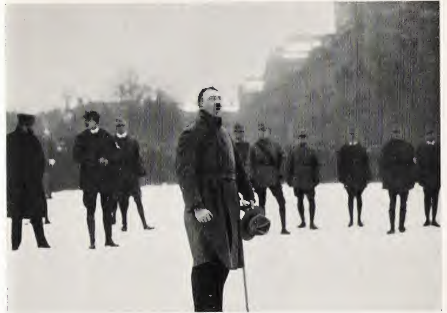
"On January 28, 1923, the first National Socialist Party Congress was held on the Marsfeld in Munich . . ."

The process of doing so went forward very slowly. The first meeting was composed only of the original seven members, with one or two onlookers. So meagre were the propaganda resources that the number of people who attended subsequent meetings increased only to 11, 13, 17, 23 and 34 respectively. At the meeting after that 111 persons were present. Hitler now spoke regularly at meetings and in that way became conscious of his oratorical gifts. He induced the committee to entrust the