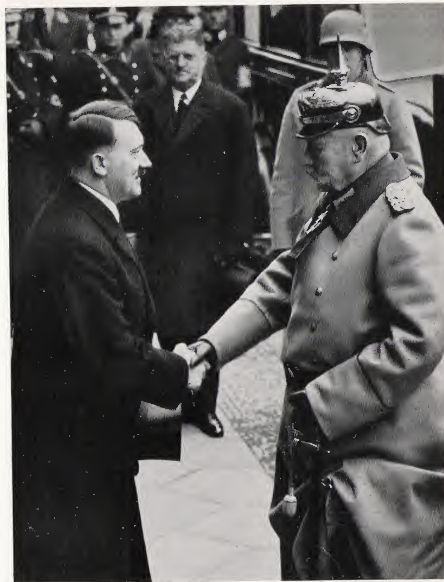
THE LATE PRESIDENT VON HINDENBURG AND ADOLF HITLER IN 1934

Towards morning it was repeatedly rumoured that Kahr, Lossow and Seisser had withdrawn from the new Government. As a matter of fact they were prisoners in the hands of the army generals who were deputizing for Lossow. Entirely on their own