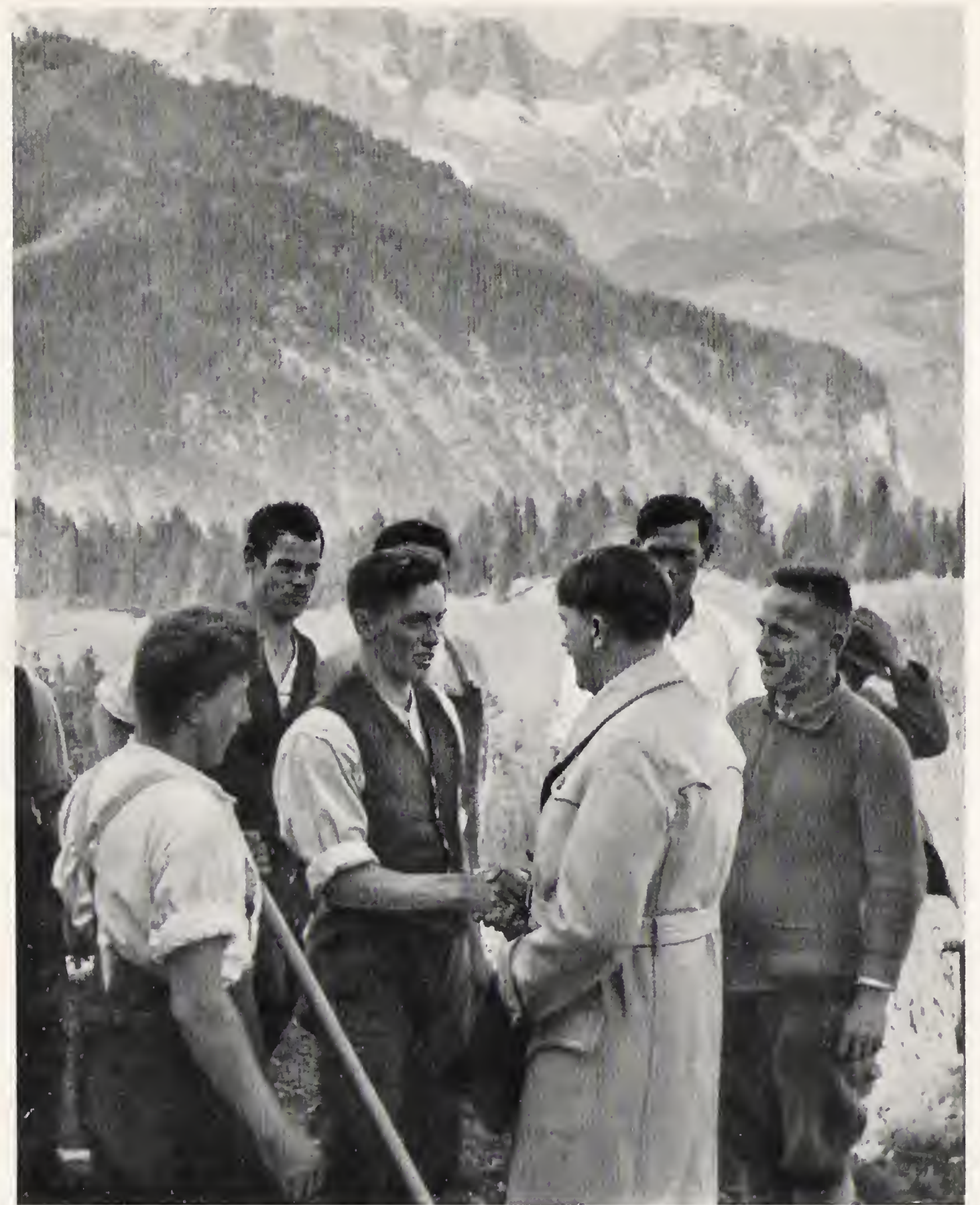
A HEARTY HANDSHAKE WITH THE WORKMEN

In his third electoral campaign, in which he used an aeroplane for purposes of rapid travel, Hitler was the central figure of the battle and went through the length and breadth of the country as a triumphant hero. Within a fortnight he spoke at 49 mass meetings. The electorate gave 13,700,000 votes for the National Socialist candidates, with the result that the latter now acquired