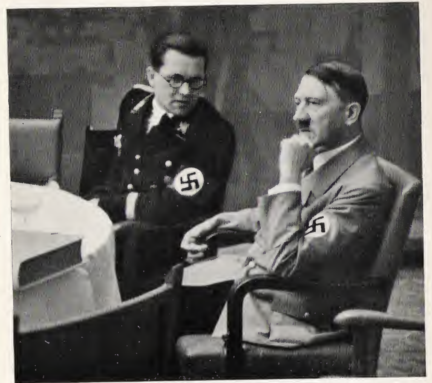
Adolf Hitler and Philipp Bouhler, the author of this biography

To understand all this one must understand and appreciate the character and personality of Adolf Hitler himself. Broad-