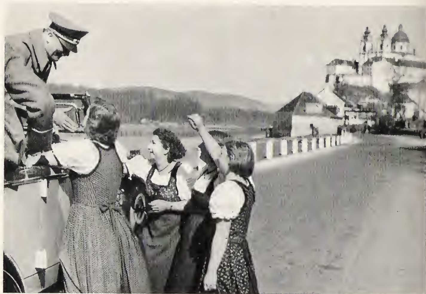
Hitler on his way to Vienna, March 12, 1938

requirements Hitler is extremely modest. He does not eat meat or take any alcoholic drinks; nor does he smoke. This is simply because he feels it suits his health better to be abstemious in regard to these things.