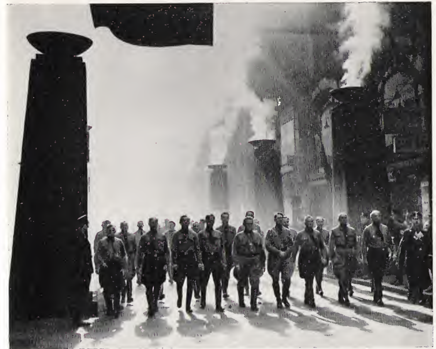
Procession in Munich, in Commemoration of November 9, 1923

There were temporary working coalitions with other associations but they lasted only for a short time. In these cases Hitler's