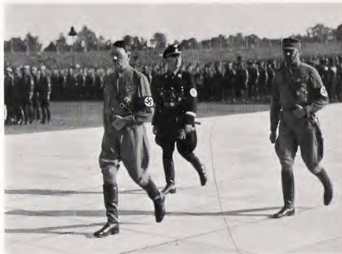
Reich Party Congress Nürnberg, 1936

And now a difficult and trying period set in for the young movement. In the first place it had no business headquarters of its own and not even a typewriter, to say nothing of being