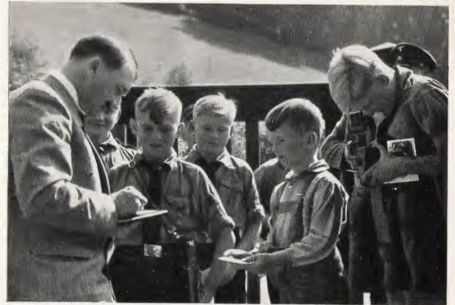
Some young Autograph Hunters

The magnitude of the victory won on March 5 was unparalleled in German history. And it was as unexpected as it was unparalleled. 17,300,000 people cast their votes for Hitler,