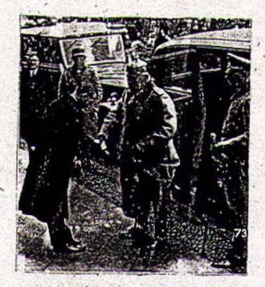
Note the subservience of Hitler's bow.

(iii) Heiden: In the midst of the Munich Putsch Hitler exclaimed to Kahr in a hoarse voice: "Excellency, I will stand behind you as faithfully as a dog!"