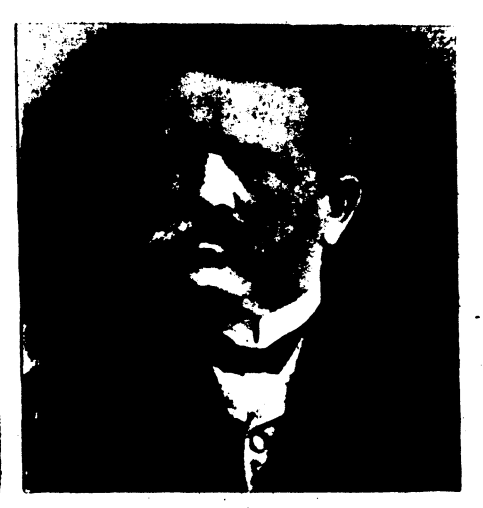
Alois Hitler - Hitler's Tether. Note resemblence to Hindenburg.