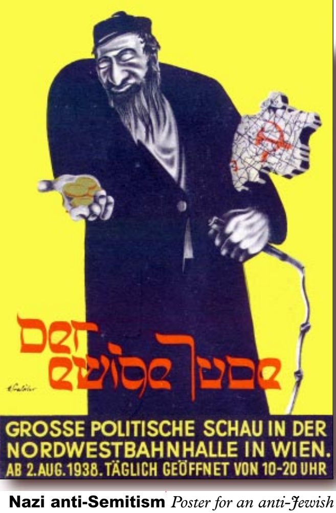
Nazi anti-Semitism Poster for an anti-Jewish exhibition in Vienna, August 1938

6.5 In Mein Kampf , which was published in 1926, Hitler developed his anti-semitism by placing his desire to remove the Jews in the context of a wider theory of the struggle between races for living space. In Hitler's view the Jews, lacking a state of their own, were parasites trying to destroy those states which had