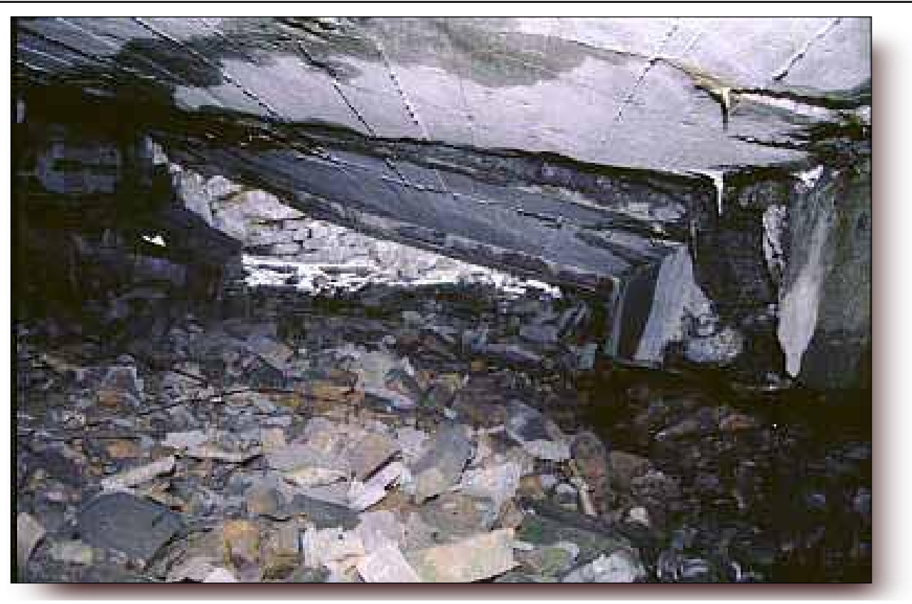
The Roof of Crematorium II: from underneath, no trace of four Zyklon-insertion manholes "seen" by the eye-witnesses