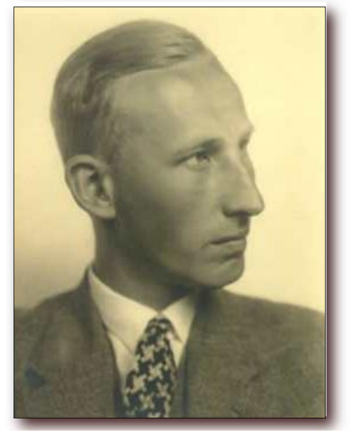
The Brain behind the Final Solution, Reinhard Heydrich, chief of the Reichssicherheitshauptamt

5.78 At a meeting held on 12 November, attended by amongst others Göring and Goebbels, the decision was taken that the