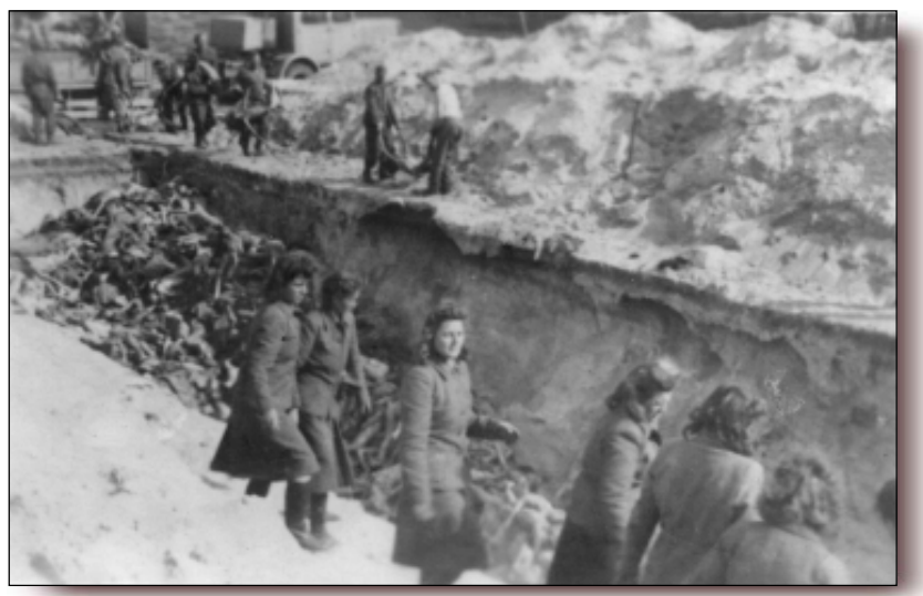
How deep is a pit? British soldiers force German female camp staff at Bergen-Belsen to bury the dead.