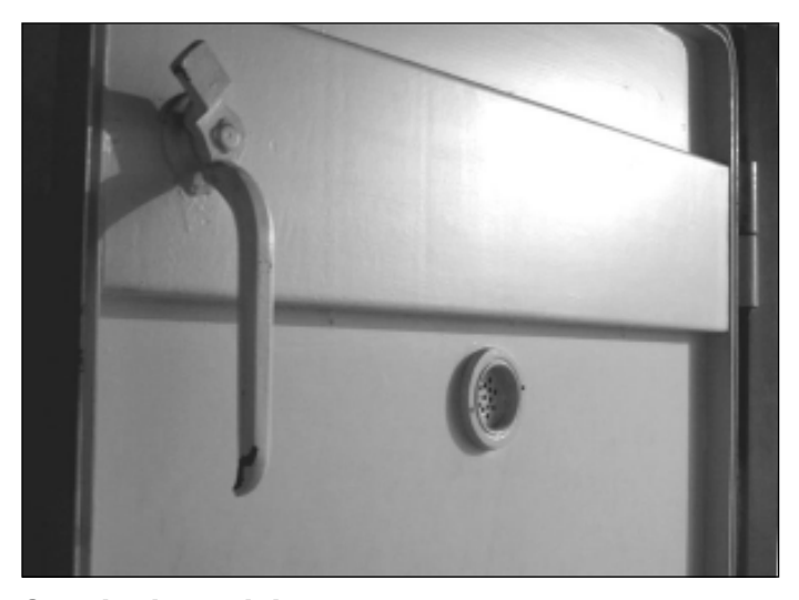
Standard gas tight air raid shelter door; peephole with grill