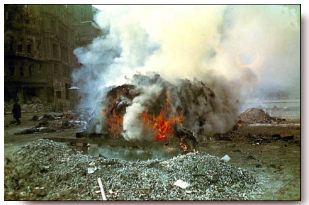
The Destruction of Dresden Mass cremation of victims of British air raid, Dresden Altmarkt, 25 February 1945