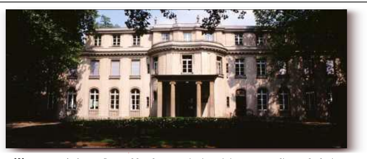
Wannsee At former Interpol headquarters junior ministers met to discuss the logistics of the Jewish problem on 20 January 1942

6.67 Irving recognised the emergence of a policy of wholesale deportation of European Jews. He accepted that Hitler was an advocate of this policy. Indeed Irving's case is that the deportation of the Jews continued to be Hitler's preferred solution to the Jewish question until 1942. The so-called "Madagascar plan", whereby the Jews were to be deported from the Reich to the island off the east coast of Africa, was not abandoned until then. Thereafter it is Irving's case that Hitler wanted the entire Jewish question put off until after the end of the war (see