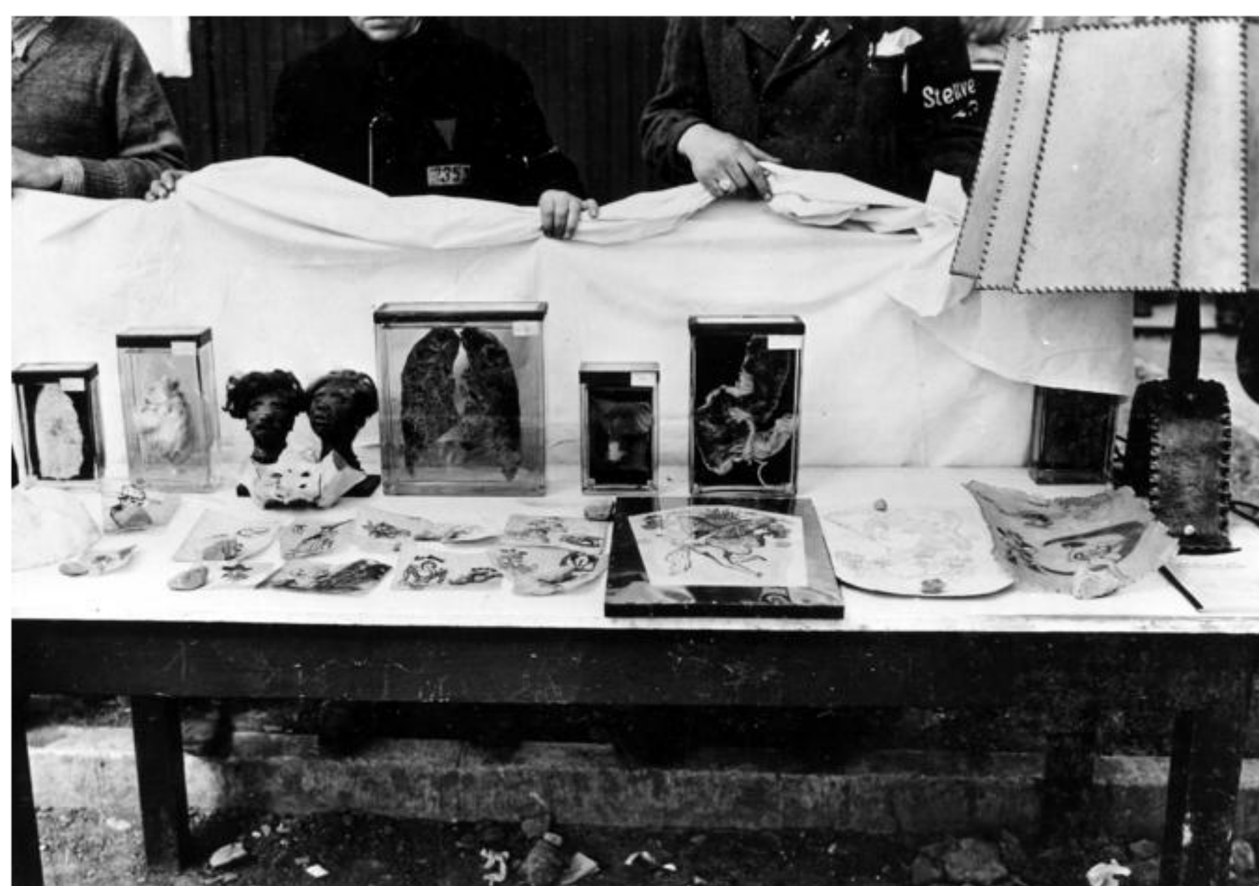
The table: Two shrunken heads on left, lampshade on right. Pelvis is in front of heads. 4

The presenter is holding up a human pelvis. Likely telling the crowd it's a human pelvis ashtray.