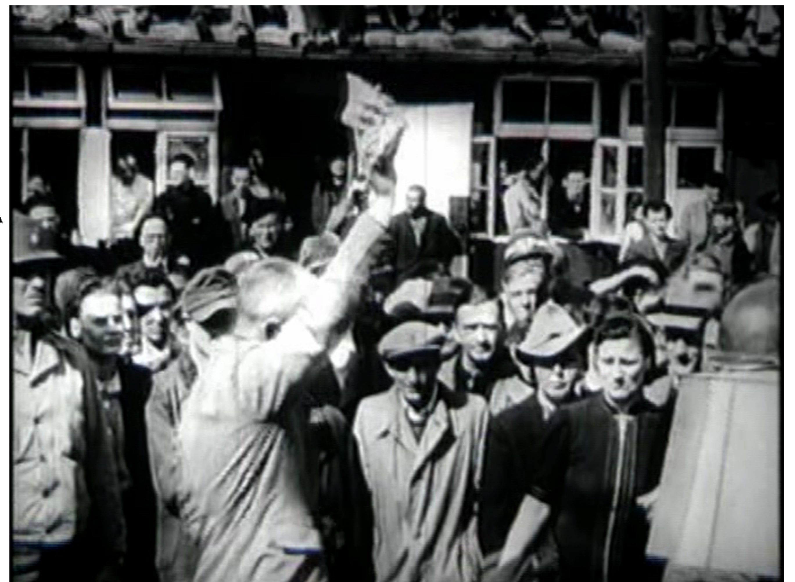
Still from "Nazi Concentration Camps" shown at Nuremberg Trial on 11/29/1945.

Presenting the table to the Germans is CD Jackson, the future publisher of Life Magazine. He will help Eisenhower's rise to presidency and will become his "Cold War Chief" special assistant. 5