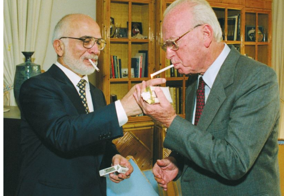
King Hussein of Jordan (left) with Yitzhak Rabin (right)

November 4 th marks the 22 nd anniversary of the alleged assassination of Yitzhak Rabin. You may recall that Rabin won the Nobel Prize in 1994 for signing the Oslo accords with Yasser Arafat and Shimon Peres. He is still widely remembered as the “soldier of peace” who would have brought an end to the Israeli-Palestinian conflict. . . if only he hadn’t been killed by a right-wing nut-job named Yigal Amir in an attempt to derail the peace process.