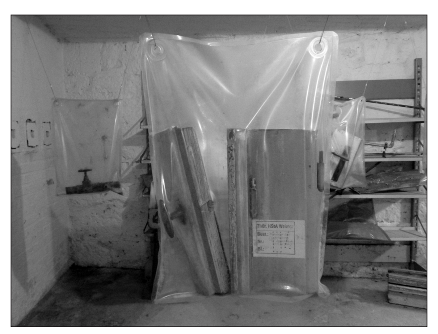
Figure 4. Hanging exhibits. Part of a permanent exhibition in basement area of Thuringia's Main State Archive in Weimar and key element of Zermahlene Geschichte by Horst Hoheisel and Andreas Knitz.

are from the time of the Gestapo, the time of the NKVD or the time of the GDR. The objects reflect the whole period). So Since the exhibits once constituted the very fabric of the building, Hoheisel and Knitz emphasize how the archive as a layered and conflicting site becomes implicated in the histories it documents. The archive, their project insists, is not a neutral space. It is where histories are preserved but also forgotten, and it seems to be a space of continuity where one regime and its abuses of power merge seamlessly with the next.