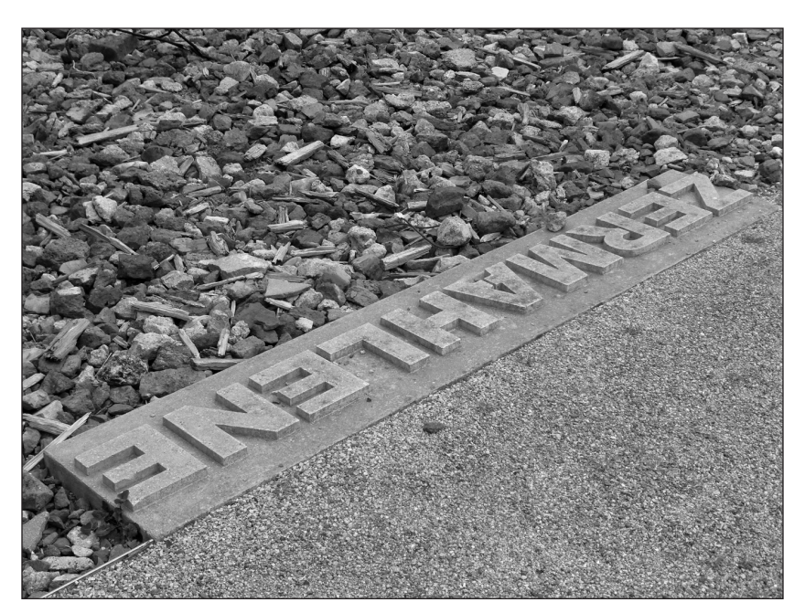
Figure 3. Exterior view of Zermahlene Geschichte in the courtyard of Thuringia's Main State Archive in Weimar. Memorial designed by Horst Hoheisel and Andreas Knitz. Photograph by the author and reproduced here with kind permission of Andreas Knitz.

clearly conflict with (or are perhaps complicit with) memory politics. They revealed the tension that arises when the archive dispenses with one history in order to make space for the "proper" preservation of another and refused to see this resolved, instead insisting that the unwanted buildings be kept within its structures after all.