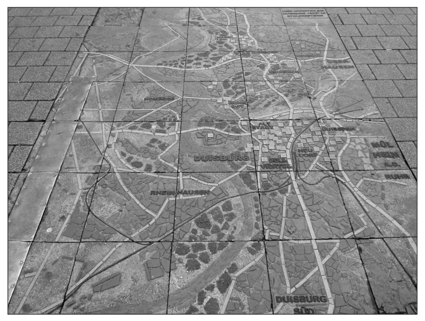
Figure 5. Memorial mosaic outside Duisburg's main railway station made by Gunter Deming and others as part of the 2002 "Jüdische Kulturtage."

work as well as their residence. Such doublings question the extent to which Stolpersteine can be reliably and meaningfully used as a documentary resource. <sup>121</sup>