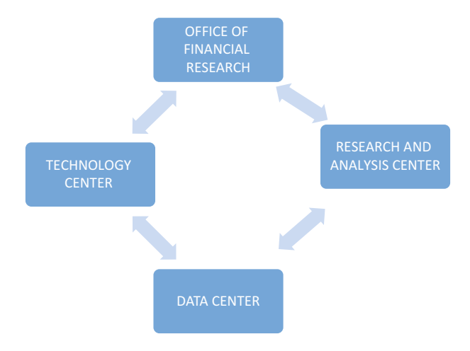
Fig. 3.1 Office of Financial Research

or whether the nature, size, scale, concentration, interconnectedness, or mix of the activities of the non-bank financial company could pose a threat to the financial stability of the USA (Second Determination Standard). The Final Rule defines the Council's meaning and application of these terms.