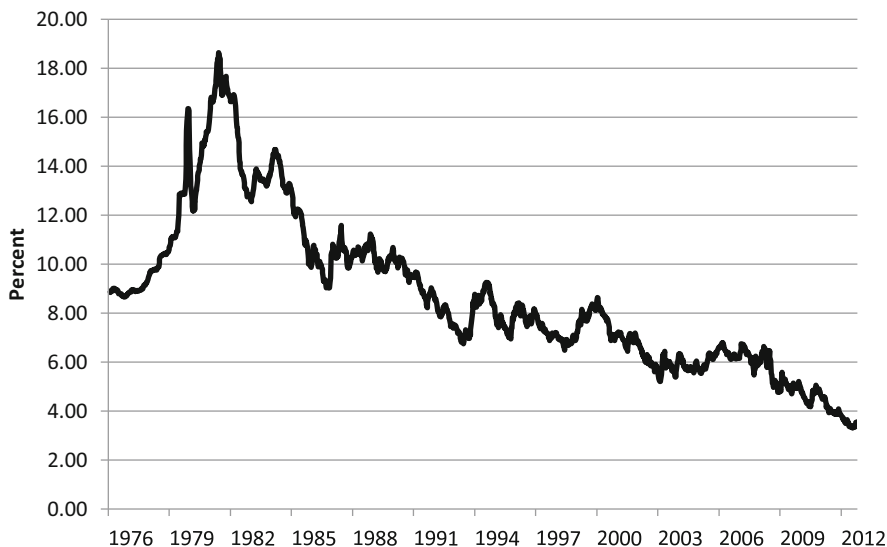
Fig. 1 Thirty-year fixed rate mortgage average in the United States.

the relatively poor US households have even further decreased relative to the richer US households.